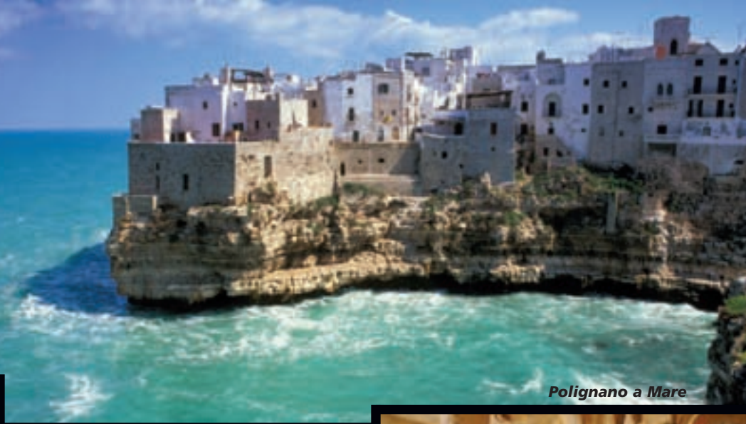
Polignano a Mare