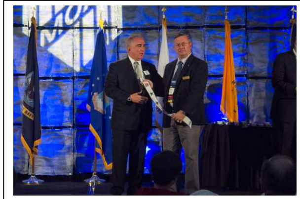
LOE Award – 2013 MOAA Annual Meeting – Colorado Springs