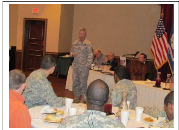
“Gold Bar” Ceremony – November Meeting