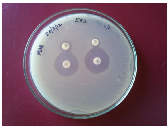
Figure-2 Plate showing ESBL production by Combination Disc Method(CDM)