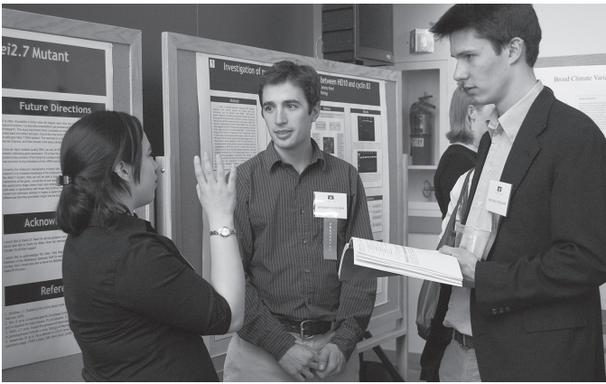
Students participating in the Student Symposium