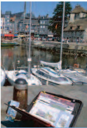
Artists from French Impressionists