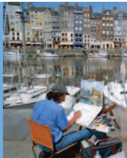
The delightful harbor of Honfleur has inspired Boudin and Monet to the present.

promenade of El Arenal, a popular route for Bilbainos' evening paseos (leisurely strolls).