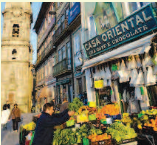
Visit an Oporto market where locals barter over fresh fare while the traditional bacalhau cod dries in the sun.

Scheduled guest speakers may be altered due to circumstances beyond our control. See Terms and Conditions.