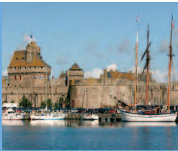
Built to protect against Norman invaders, the medieval walls of St. Malo still stand along the English Channel.

a galloping horse.” Stroll the cobblestone Grande Rue through the fortified village to visit the spectacular medieval abbey and cloisters, a pilgrimage site since, as legend has it, the Archangel Michael appeared to Bishop Aubert of Avranches in the early eighth century and commanded him to build a sanctuary here. Walk through the monastery’s vaulted scriptorium and refectories.