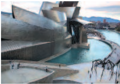
Bilbao's avant-garde Guggenheim Museum is perhaps the 20th century's most audacious architecture, wrapped in shining waves of titanium.