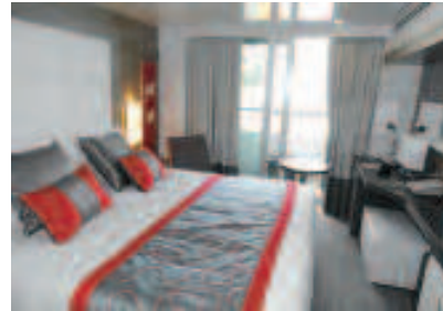
Stateroom with balcony

The state-of-the-art propulsion system provides an exceptionally smooth, quiet and comfortable voyage by creating little vibration and significantly reduced engine noise. The ship is designed to prevent contact with environmentally sensitive seabeds and meets the latest "Clean Ship" standards. The ship has two tenders.