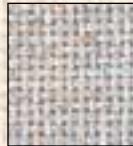
Blue Neutral Code: QE