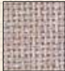
Cherry Neutral Code: QI