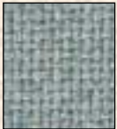
Aquamarine Code: QK

* Complete item code with panel fabric desired from the following Equal colors: