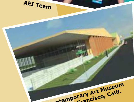
New Contemporary Art Museum located in San Francisco, Calif.