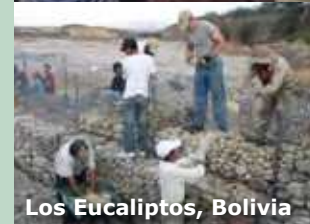
Los Eucaliptos, Bolivia