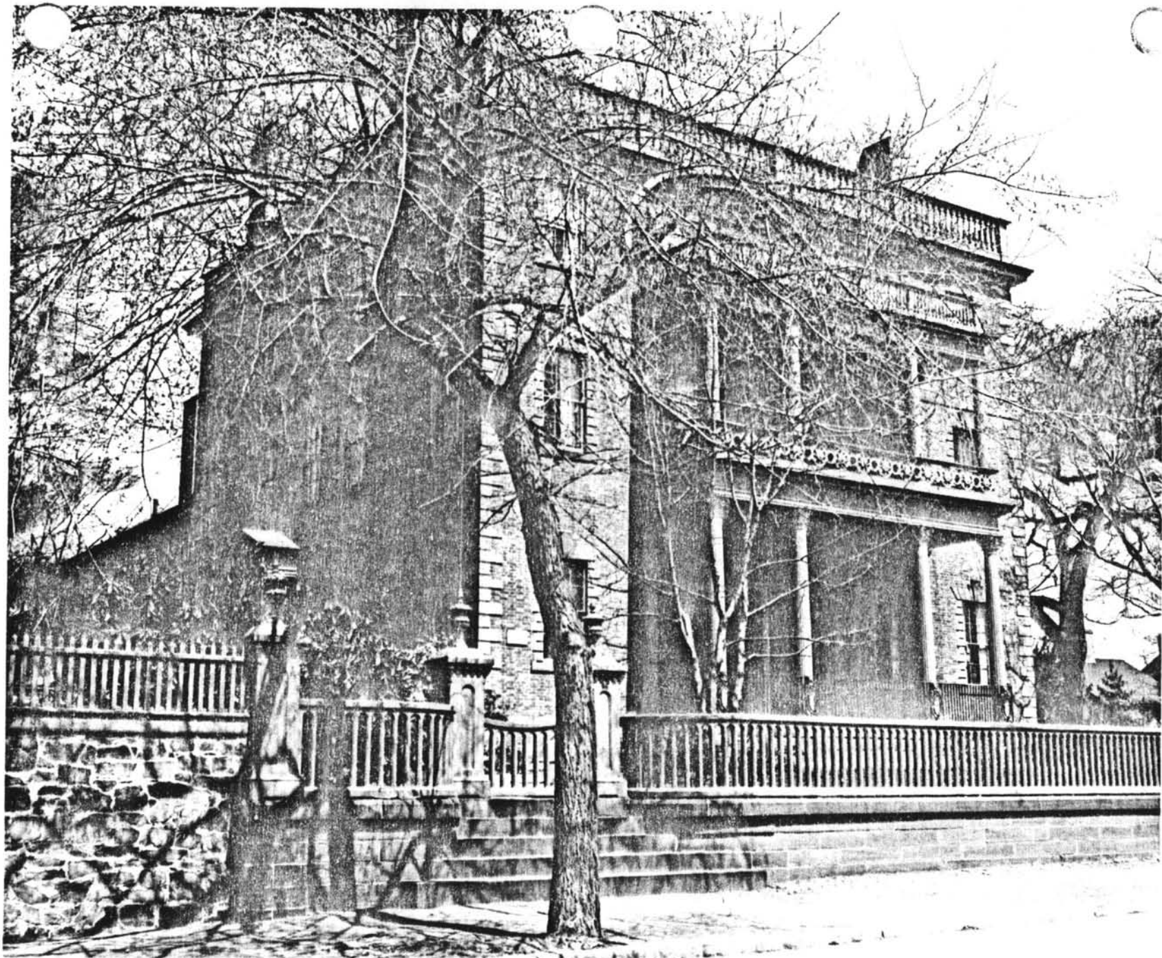
Edward Carrington House, Providence, Rhode Island