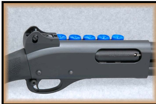
Optional rear-mounted ghost-ring sight