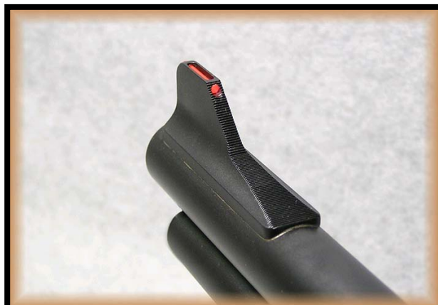
Optional fiber optic front sight