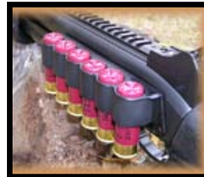
Mesa Tactical side saddle