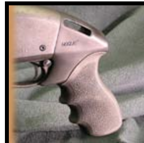
Grips & stock sets