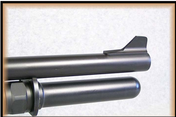
Standard front blade sight