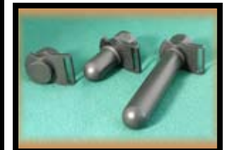
Mag tube extensions