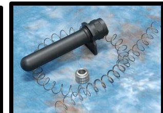
Mag tube extension kits