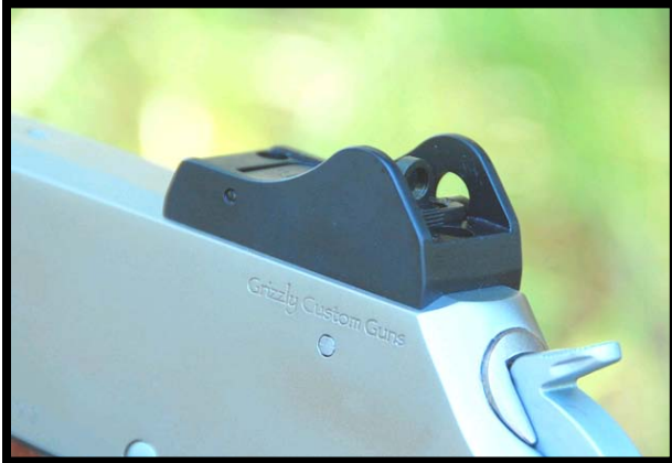
Standard ghost-ring rear sight