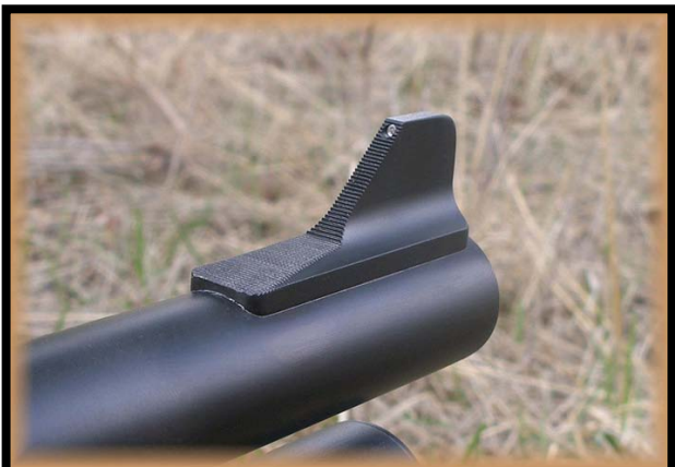
Optional front Trijicon tritium insert