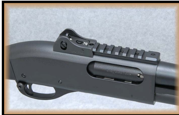
Optional short Picatinny rail section