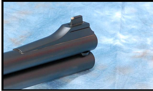
Optional ramped front sight with interchangeable inserts.