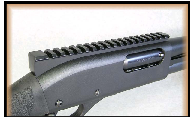
Optional full-length Picatinny rail