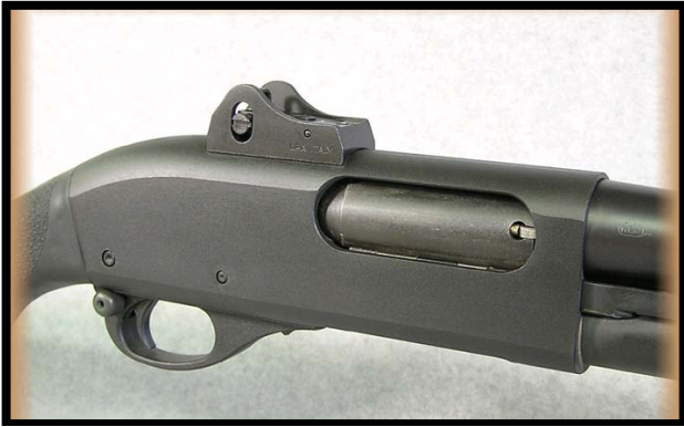
Standard ghost-ring rear sight