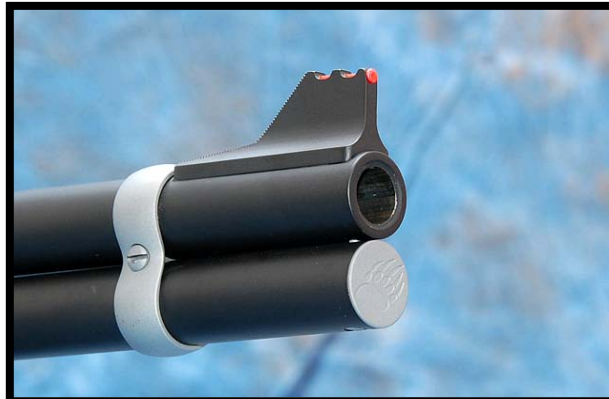
Optional fiber optic front sight