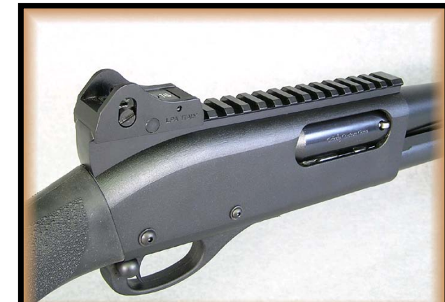
Optional full-length rail w/ ghost-ring sight