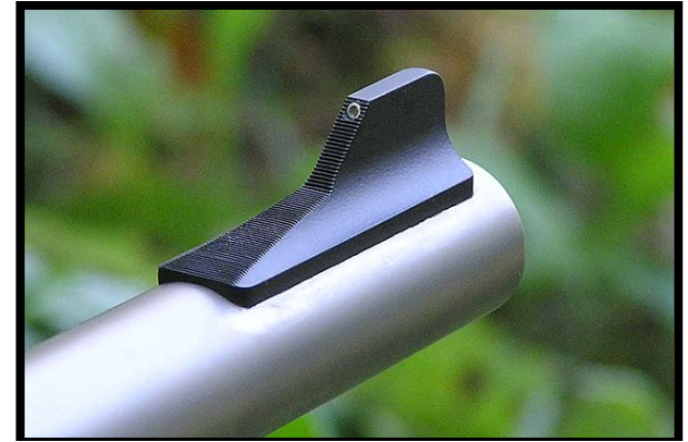
Optional Trijicon Tritium insert