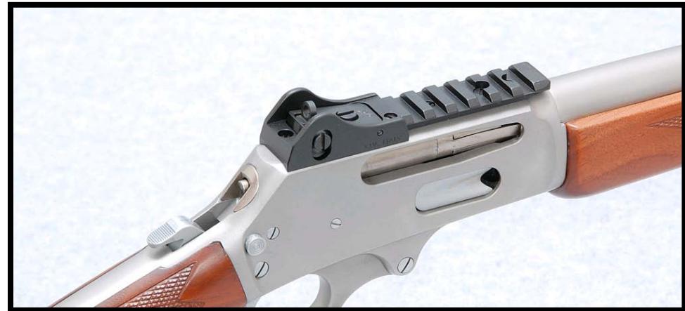
Receiver-mounted short Picatinny rail for red dot optic