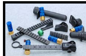
Pic rails, sights, etc.