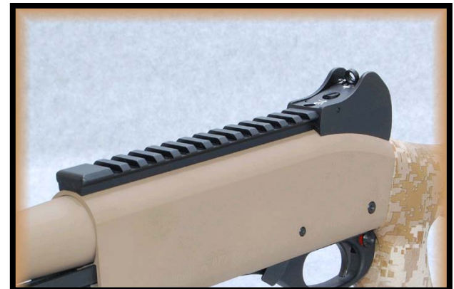
Optional rear-mounted sight & Picatinny rail