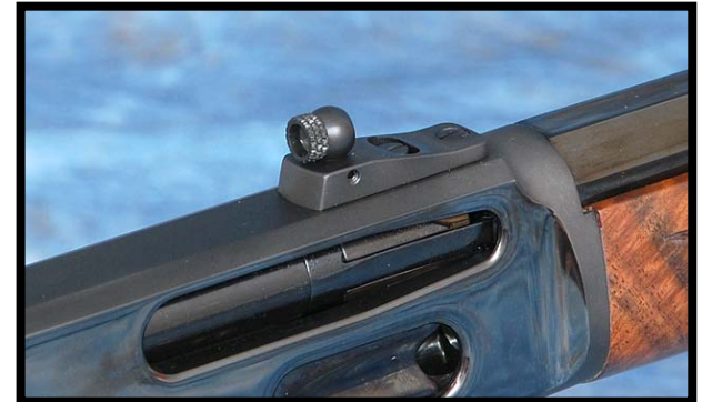
Optional ghost-ring rear sight