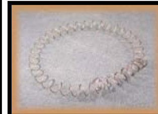
Mag tube springs