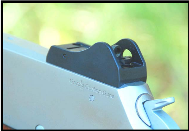
Standard ghost-ring rear sight