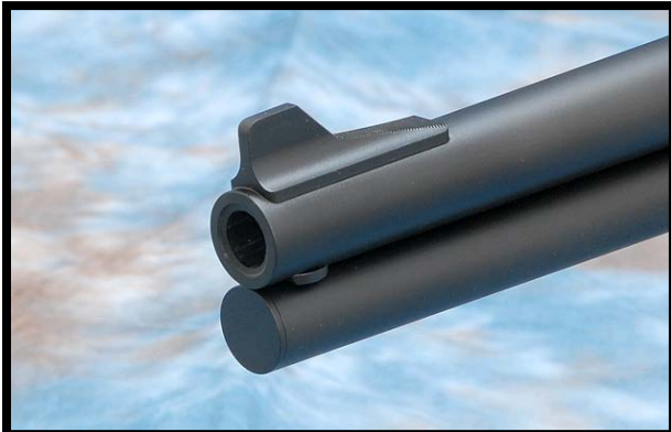
Standard blade front sight (black)