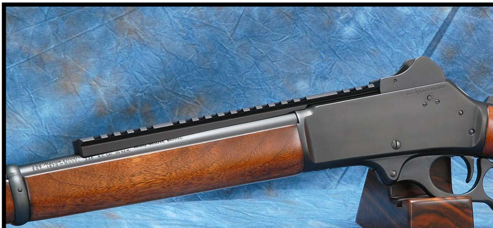
Full length Picatinny rail for Scout scope, red dot, or conventional scope