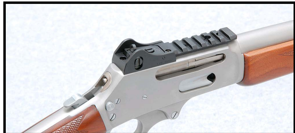
Receiver-mounted short Picatinny rail for red dot optic