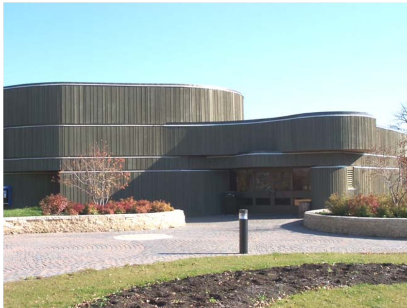
Visitor Reception Centre