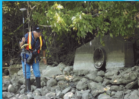
City of Lansing IDEP on the Grand River - Draw Down