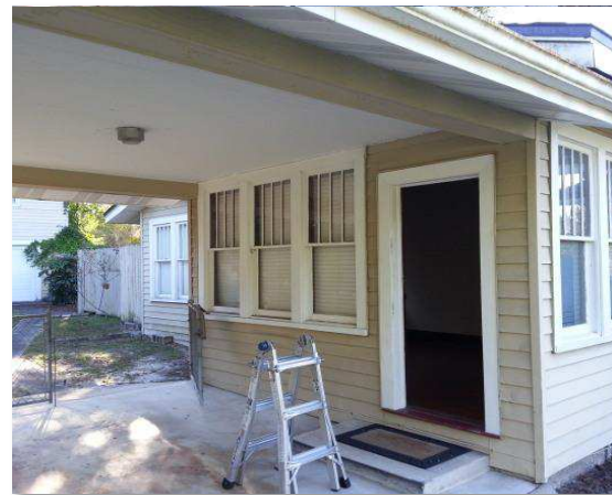
Left side elevation