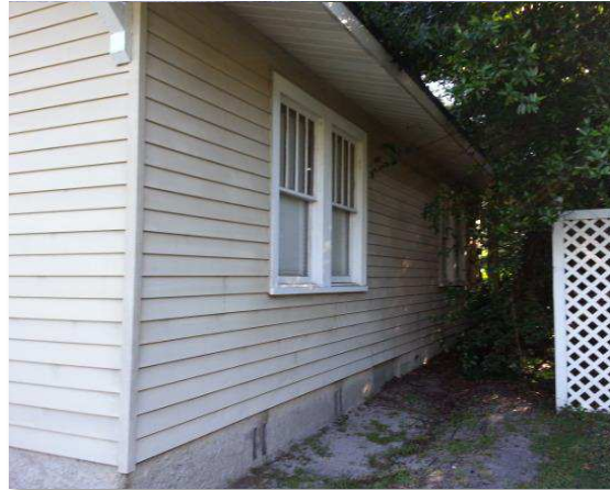
Right side elevation