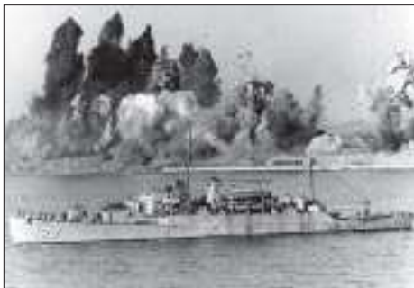
The U.S.S. Begor

The reunion was held to honor the ship's involvement in the destruction of Hungnam Harbor in Korea in December 1950 by Navy Seals stationed aboard the Begor. (The scene, pictured at left, is one of the more famous naval pictures of the Korean War.)