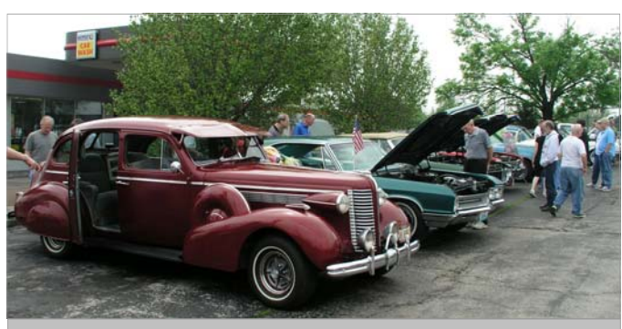
Sinclair advertising always brings out some interesting Buicks like the 1938 street rod in this line.