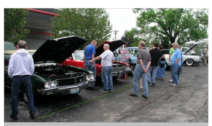
Cars came and went during the day and so did the people from the street. Great attendance.