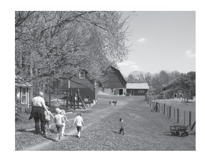
West Lakeland, Minnesota