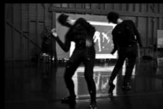
PHOTOS FROM MOTION CAPTURE WORKSHOP, SEAM2010