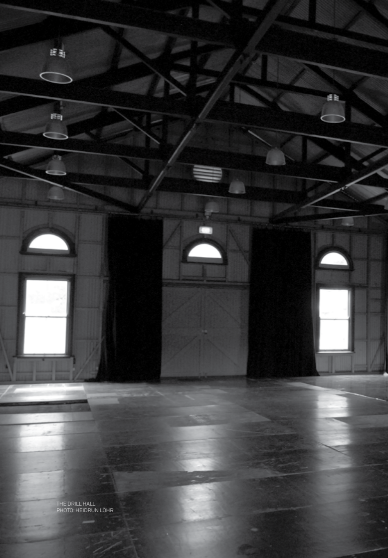
THE DRILL HALL