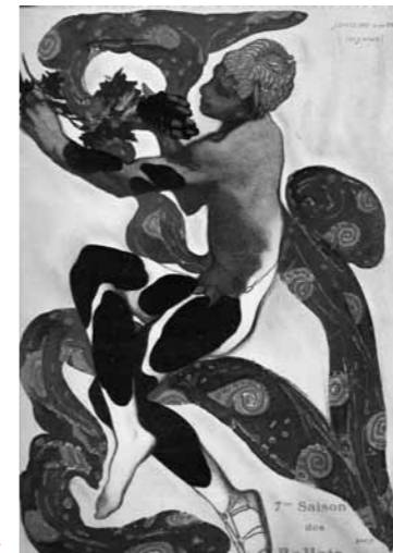
MARTIN DEL AMO, ANATOMY OF AN AFTERNOON IMAGE CREDIT: LEON BAKST, NIJINSKY IN 'AFTERNOON OF A FAUN' 1912