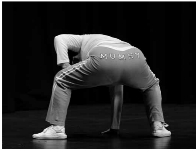
JULIE-ANNE LONG AS MUMSY