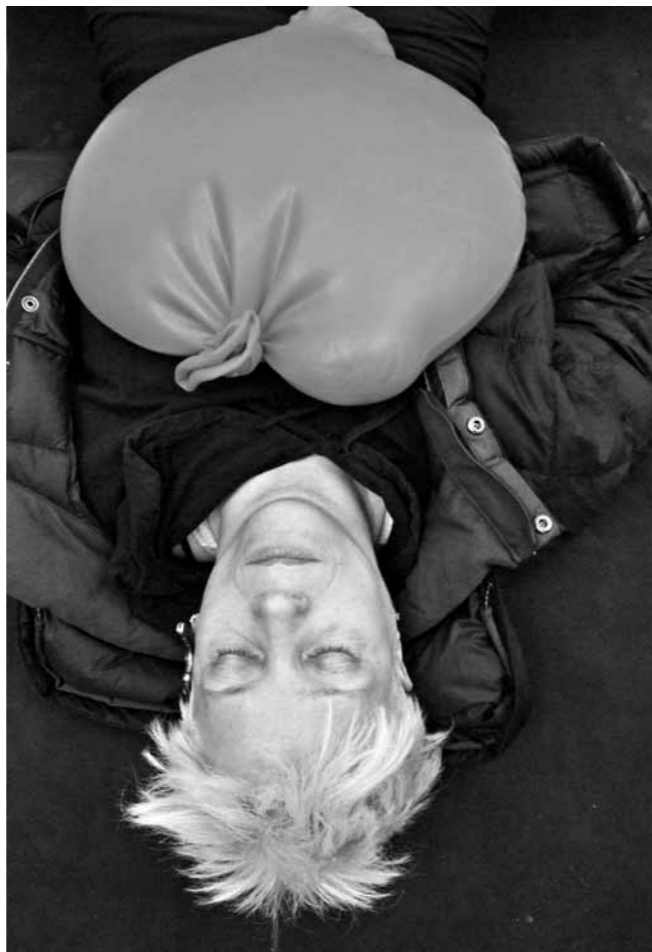
→ LUSCIOUS APPARATUS