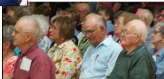
Front Cover: Knights sign in Climax.