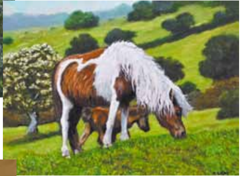
Dartmoor Pony