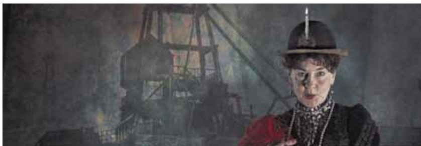
Miracle Theatre Company - 'TIN'