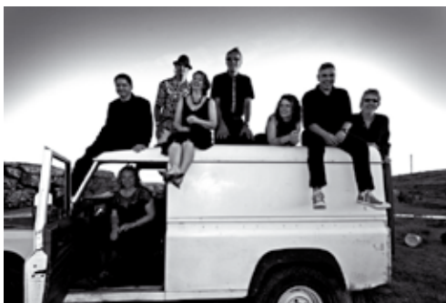
The Cuckoo Collective

Tickets £6 (in advance); £8 on the door (£5 Friends of the Music and Arts Festival) from the Wharf Arts Centre Box Office, or on the door. The barbecue will be serving food and the bar will be open