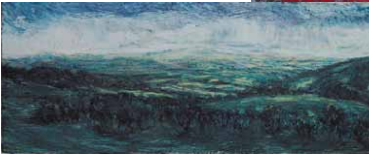
The Blue Harvest - Mary Gillett