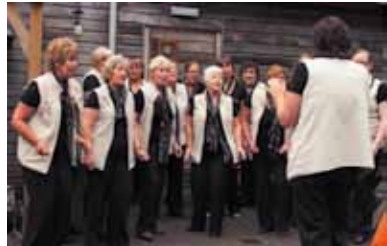
Brunel Harmony Chorus

Tickets £8 (in advance); £10 on the door (£5 Friends TM&AF) from the Wharf Arts Centre Box Office, or on the door. The barbecue will be serving food and the bar will be open