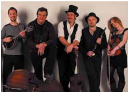
Mad Dog Mcrea

Tickets £8 (in advance); £10 on the door (£5 Friends of the TMAF) from the Wharf Arts Centre Box Office, or £10 on the door. The barbecue will be serving food and the bar will be open