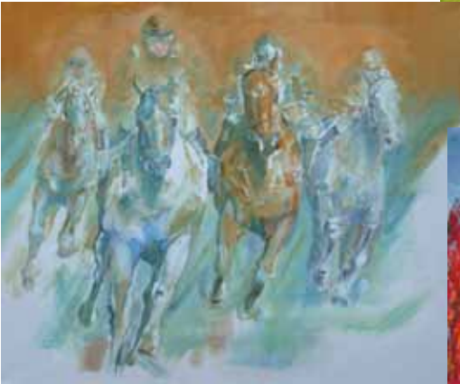
Racehorses - Trudy Redfern