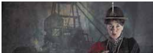
Miracle Theatre Company - 'TIN'

Tickets: £14 (£12/£8 concessions) from the Wharf Arts Centre Box Office, or £15 on the door