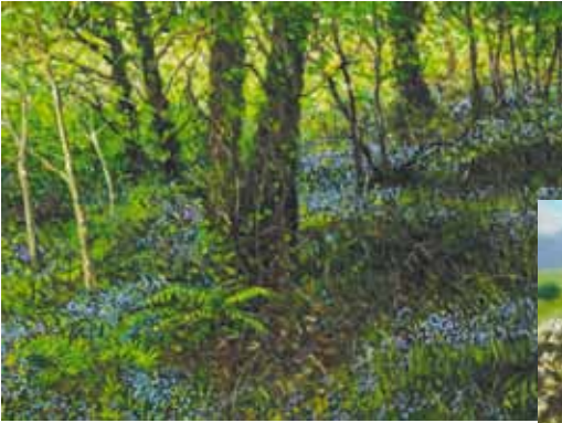
Bluebells Mt Edgcombe- David Gray