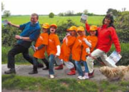
Arthritis Research UK

In association with the Spring Trail Festival. £3 Per Child, Adults Free, booking essential (01822 853030): Car Park £2: bring a packed lunch!