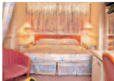
Category 1 Stateroom

All 113 spacious, outside staterooms or suites (ranging in size from 183 sq. ft. to 398 sq. ft.) are tastefully appointed and feature two lower twin beds that convert to one queen bed upon request, a private bathroom with shower (some staterooms have bathtubs and showers), telephone, television, DVD, minibar, double full-length closets, two nightstands, desk, hair dryer, duvets and plush terry cloth robes. Room service is available.