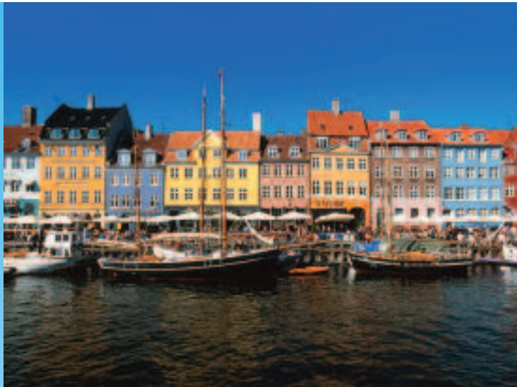
Discover Copenhagen's Viking roots along the city's scenic waterfront, where centuries of maritime history still come to life.