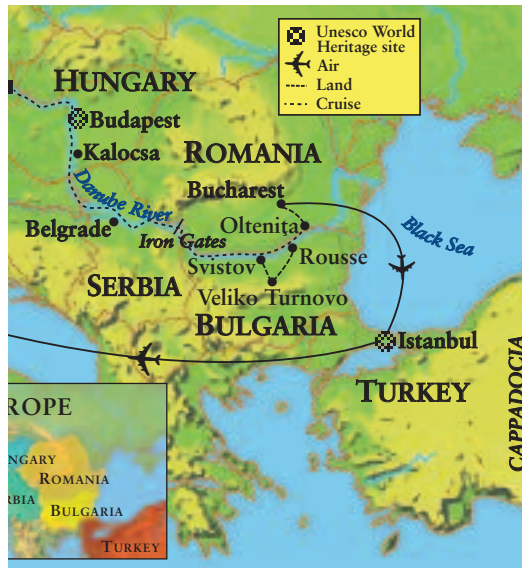
1721, the diminutive Stavropoleos Church is an elegant and European architectural styles.