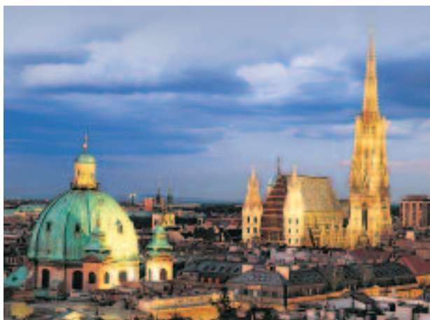
Its soaring spire and multi-colored tiled roof make St. Stephen's Cathedral Vienna's most beloved landmark.