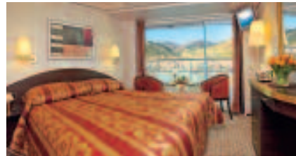
Stateroom Category 1

The friendly, highly trained international crew provides guests with a high level of personalized, attentive service. The ship also meets the highest international environmental and safety standards.