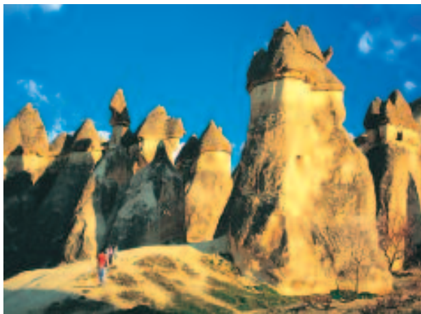
Step into a fascinating world like no other in the towering volcanic stone forests of Cappadocia.

Join this exceptional three-night extension to the mesmerizing landscapes of Cappadocia, a UNESCO World Heritage site and one of nature's most captivating and unique treasures. Stay in the elegant Cappadocia Cave Resort in Göreme National Park. Explore ancient churches carved into the region's famous volcanic rock formations, visit typical Cappadocian villages, tour a traditional winery and learn about the region's distinctive culture, which traces its roots to Biblical times. Complete details will be provided with your reservation confirmation.