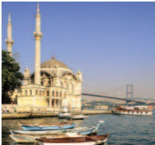
Flanked by the elegant Ortaköy Mosque, the Bosphorus Bridge is a modern symbol of Istanbul's age-old status as a crossroads of Europe and Asia.