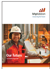
Sustainability Report 2011

The Sustainability Reporting Navigator indicates the sections of BHP Billiton's Sustainability Report, Annual Report and Summary Review that specifically address what we have done to address the GRI guidelines and uphold the 10 principles of the United Nations Global Compact and the International Council on Mining and Metals.