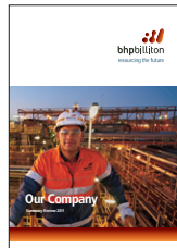
Summary Review 2011