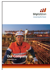
Annual Report 2011