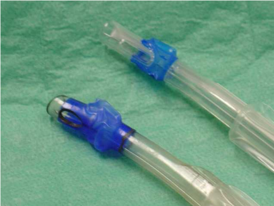
Figure 2: Murphy eyes of Mallinkrodt & Rusch tubes

small hole towards the end of the endobronchial part called a Murphy eye. This has to be aligned with the entrance to the right upper lobe, or the lobe will not be ventilated. Of the currently available DLTs, the Rusch tube has a larger and more elongated Murphy eye compared to the Mallinkrodt (fig2), allowing for more variability in anatomy. Changing tube size may also compensate for variable anatomy.