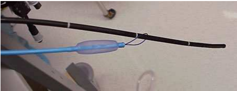
Figure 3: Bronchial blocker

A bronchial blocker (fig 3) is a device that is inserted into a conventionally placed single lumen tube. It is useful when it is not possible to place a DLT or in situations where the patient has already been intubated with a single lumen tube. It has the appearance of a hollow bougie with a cuff. There is a type that has a steerable tip (Cohen by Cook) as well as the basic type that cannot be steered (Arndt). The blocker has a guidewire in its lumen, the end of which can be hooked over a bronchoscope so the blocker can be inserted under direct vision into the lung that is to be collapsed. This guidewire needs to be removed before air can be withdrawn from the blocker and hence collapse the lung. A disadvantage is that once the guidewire on the device has been withdrawn, it cannot be reinserted so the blocker cannot be reused or repositioned in the patient. Also, because a bronchoscope needs to be used both to guide the blocker into place and to verify its position, this means that if there is blood or secretions in the airway, this technique may not be possible.