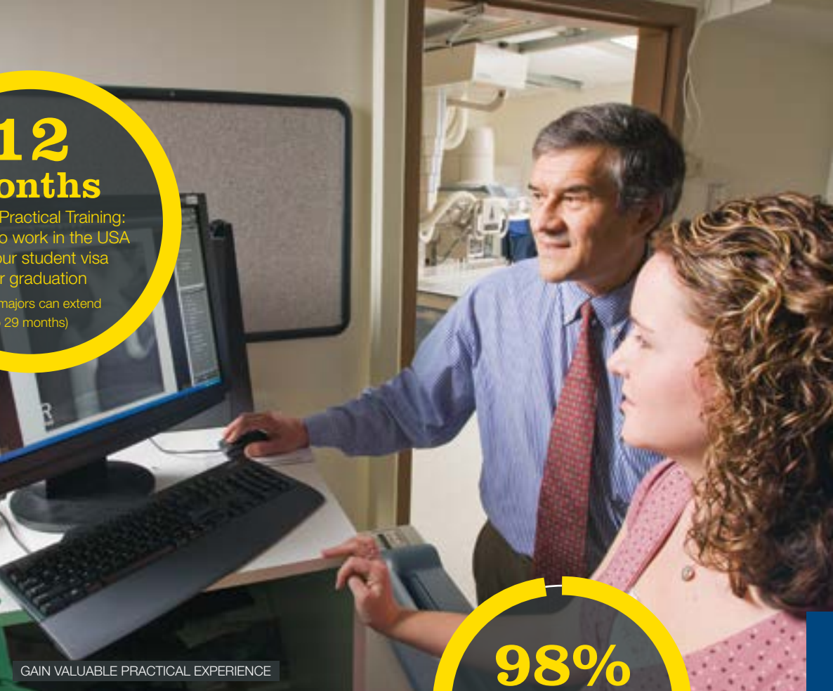
GAIN VALUABLE PRACTICAL EXPERIENCE