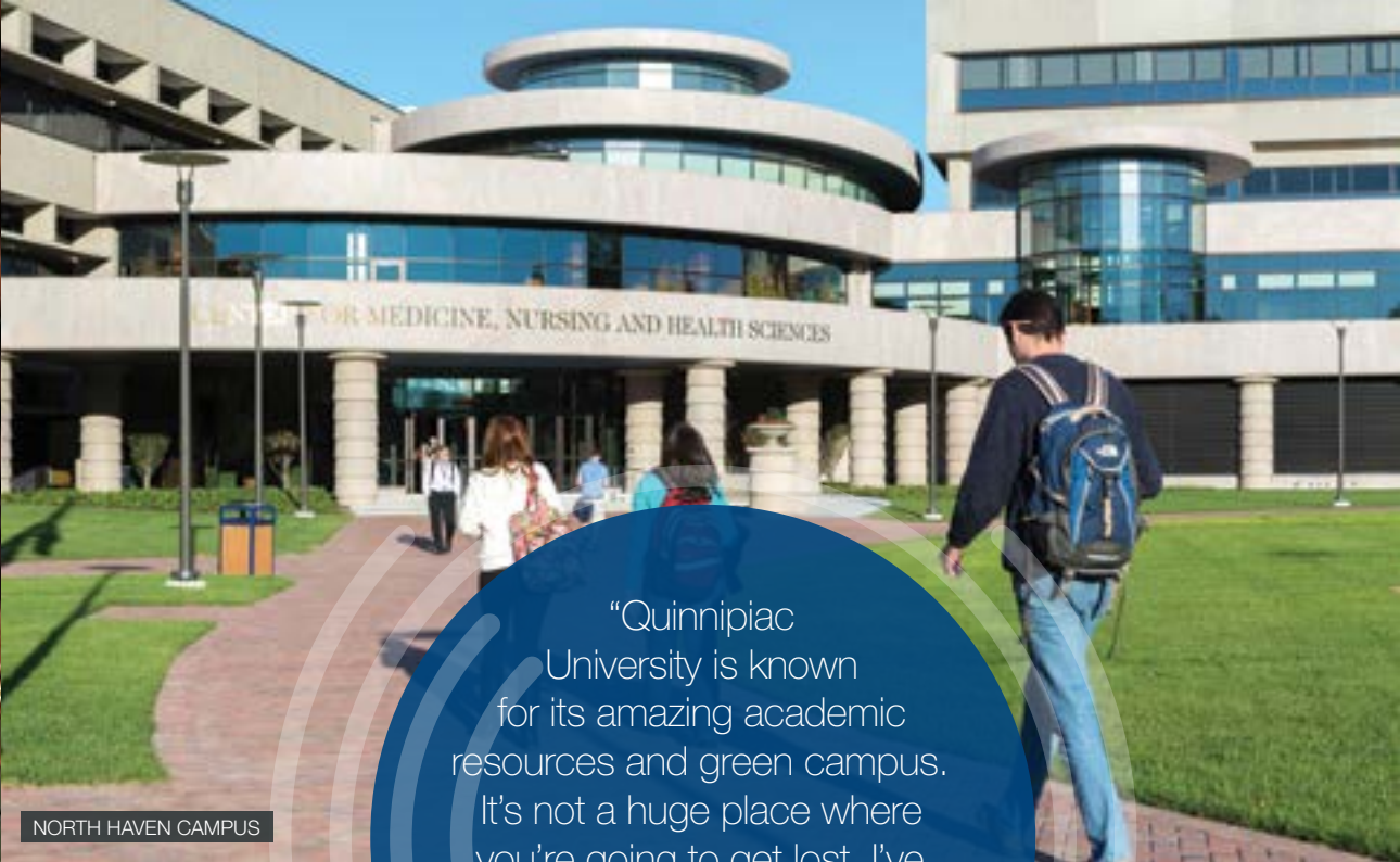
NORTH HAVEN CAMPUS

"Quinnipiac University is known for its amazing academic resources and green campus. It's not a huge place where you're going to get lost. I've made strong friendships here — it really is a great community."