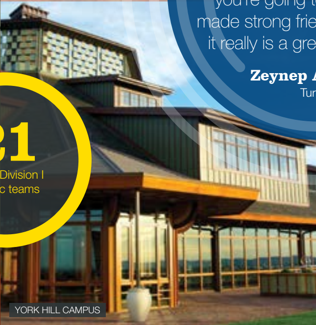
YORK HILL CAMPUS