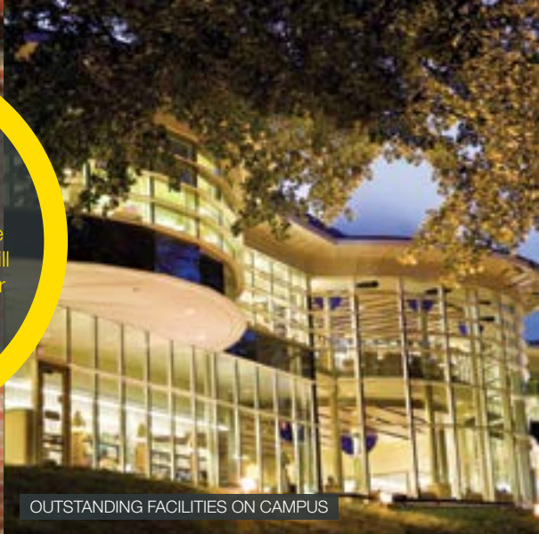
OUTSTANDING FACILITIES ON CAMPUS