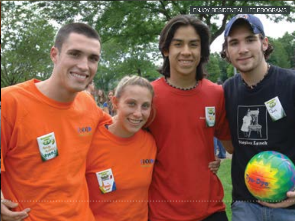
ENJOY RESIDENTIAL LIFE PROGRAMS