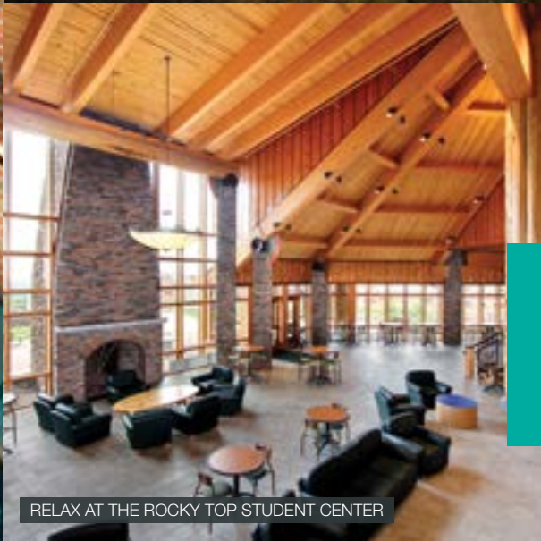
RELAX AT THE ROCKY TOP STUDENT CENTER

Insurance Health insurance is required for all F-1 visa holders. Insurance details will be provided once you receive an offer from Quinnipiac University. Ask your Global Pathways representative for more information on the best insurance options available to you. Scholarships Academic merit scholarships, covering partial tuition in your first year may be available. Ask your Global Pathways representative for more information. Transfer I-20 Applicants who are already studying at another university in the USA can enroll at Quinnipiac University without reapplying for a visa, by transferring their I-20. For further information, ask your Global Pathways representative or visit: www.ice.gov/sevis/f1-transfers