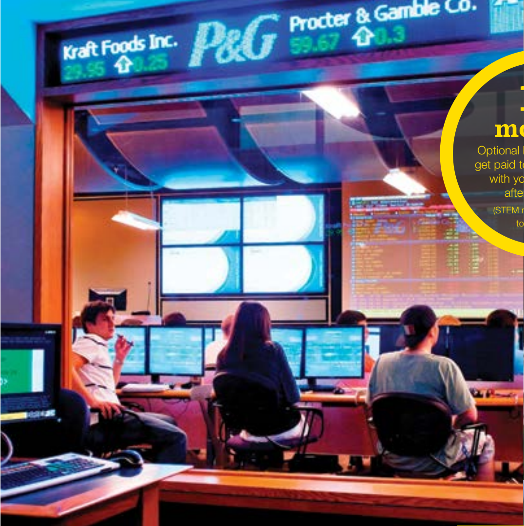
TERRY GOODWIN FINANCIAL TECHNOLOGY CENTER

Quinnipiac students undertake a wide variety of internships. The School of Business co-sponsors more than 150 internships that offer first-hand experience in a business environment. Business students have interned at organizations as varied as Pfizer Pharmaceuticals, NBC Sports Group and Goldman Sachs. Most students in the School of Communications complete a 120-hour internship for academic credit. Communications students have access to more than 1,000 field placements across the USA in the broadcast, media, and sound recording industries.