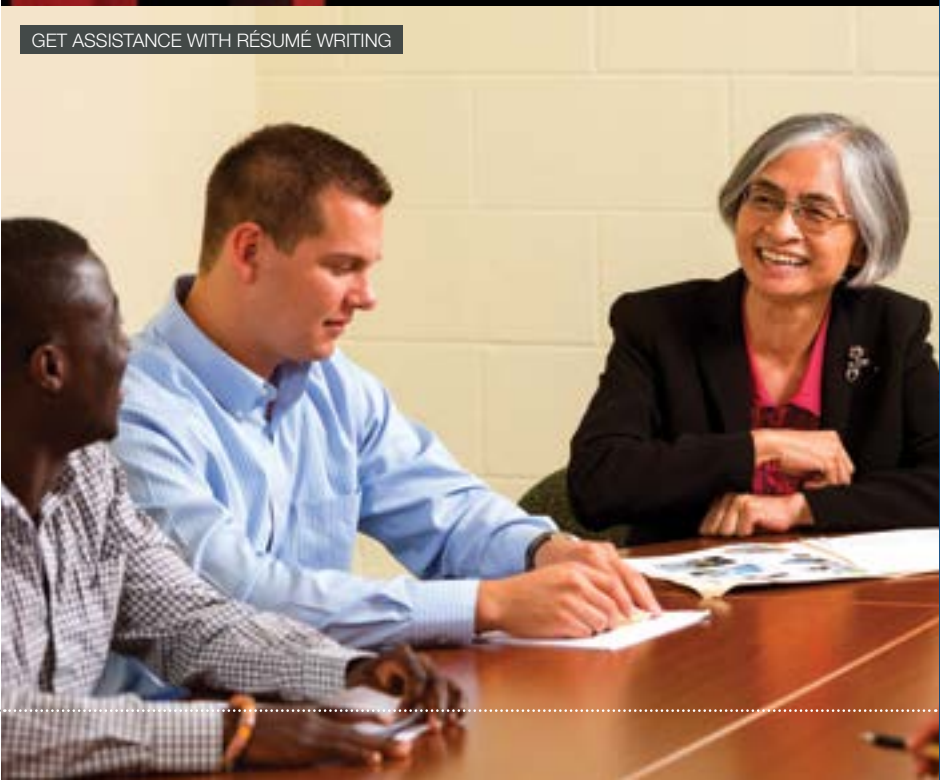
GET ASSISTANCE WITH RÉSUMÉ WRITING