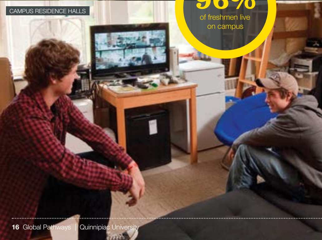
CAMPUS RESIDENCE HALLS