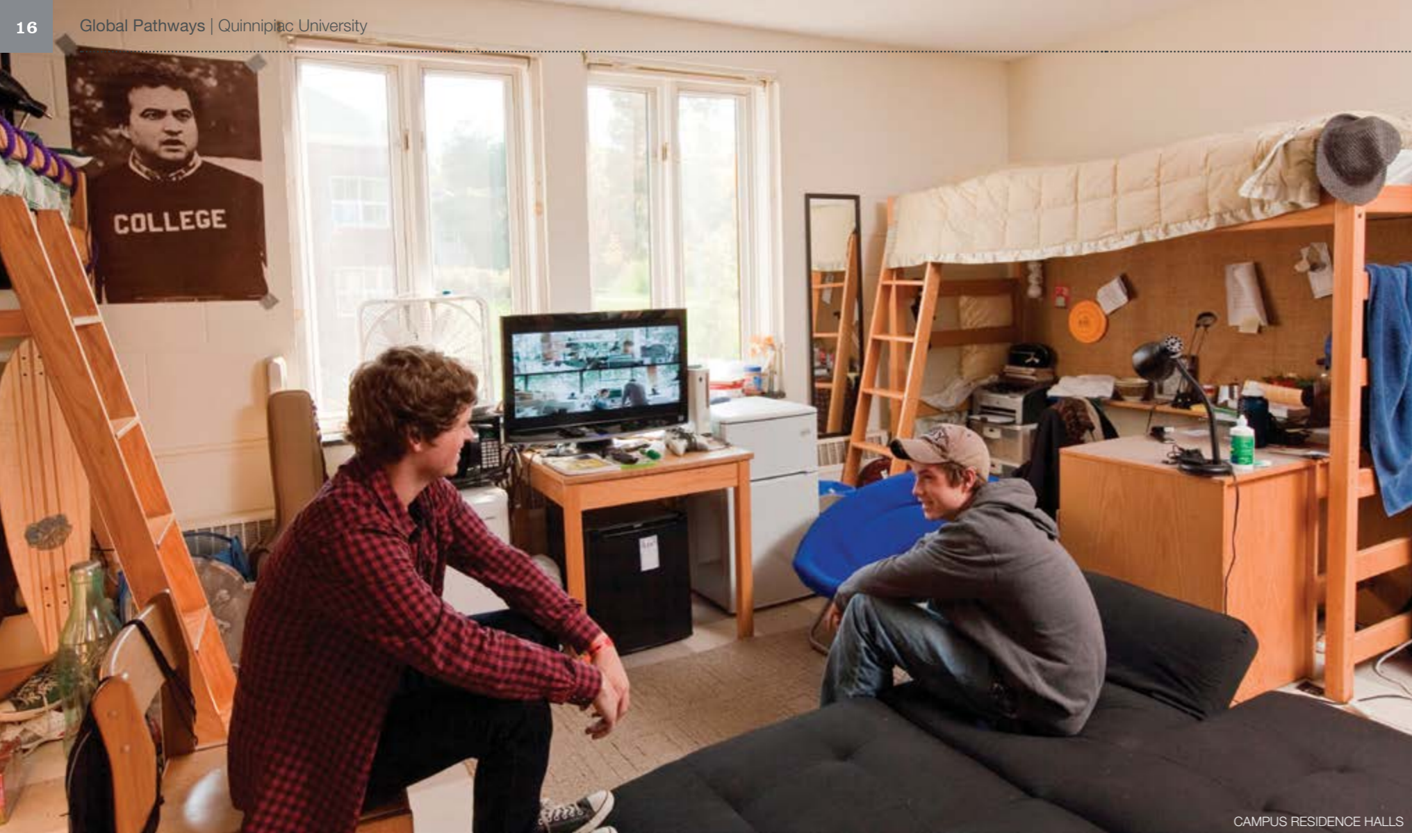
CAMPUS RESIDENCE HALLS