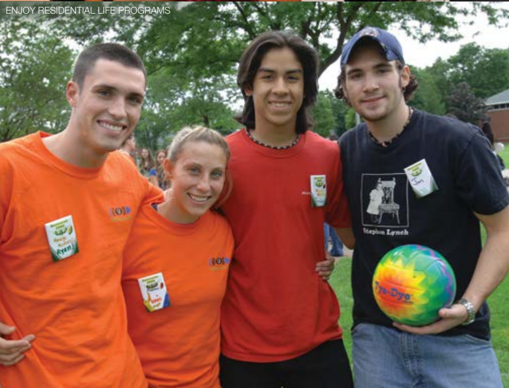
ENJOY RESIDENTIAL LIFE PROGRAMS