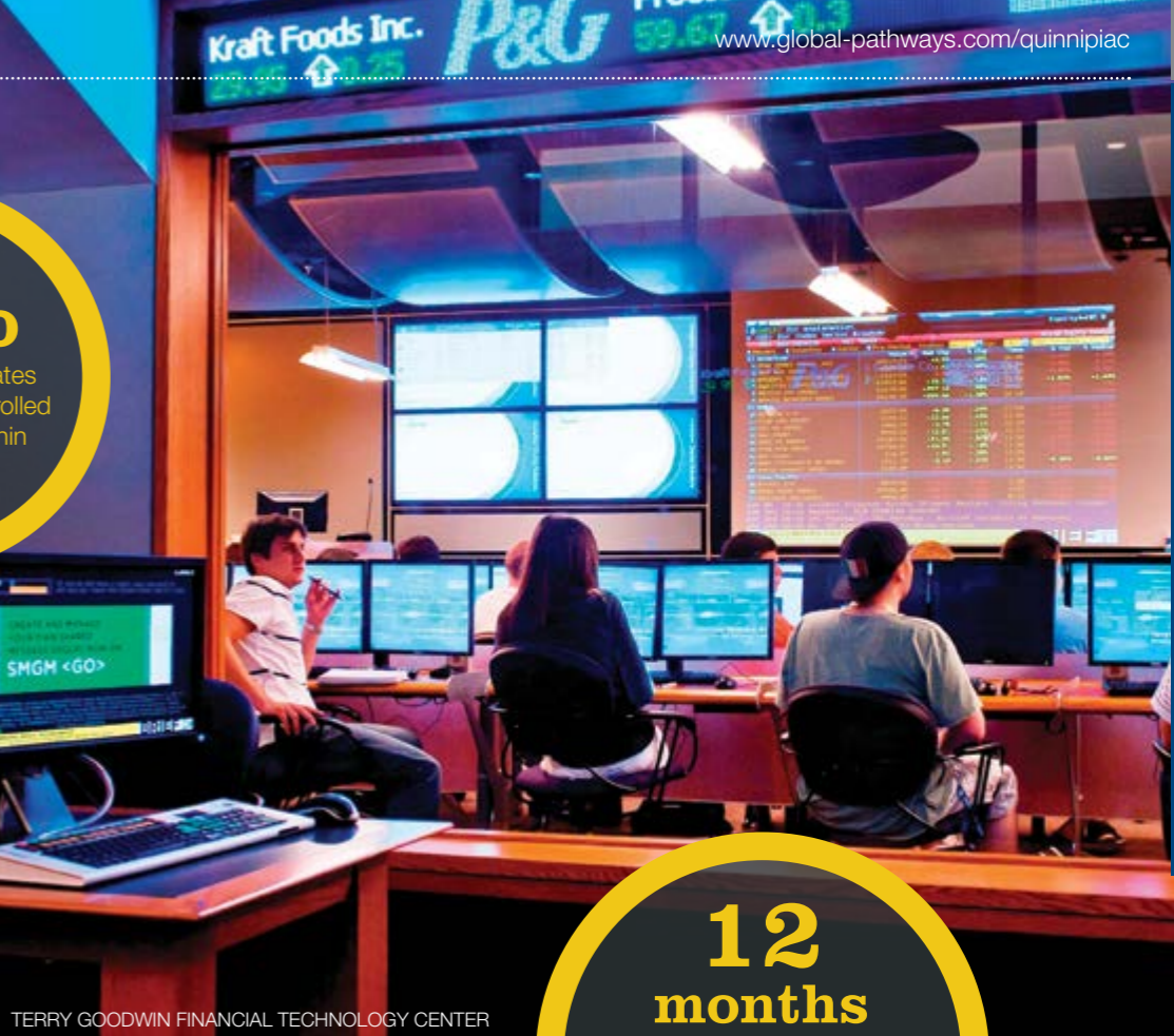
TERRY GOODWIN FINANCIAL TECHNOLOGY CENTER