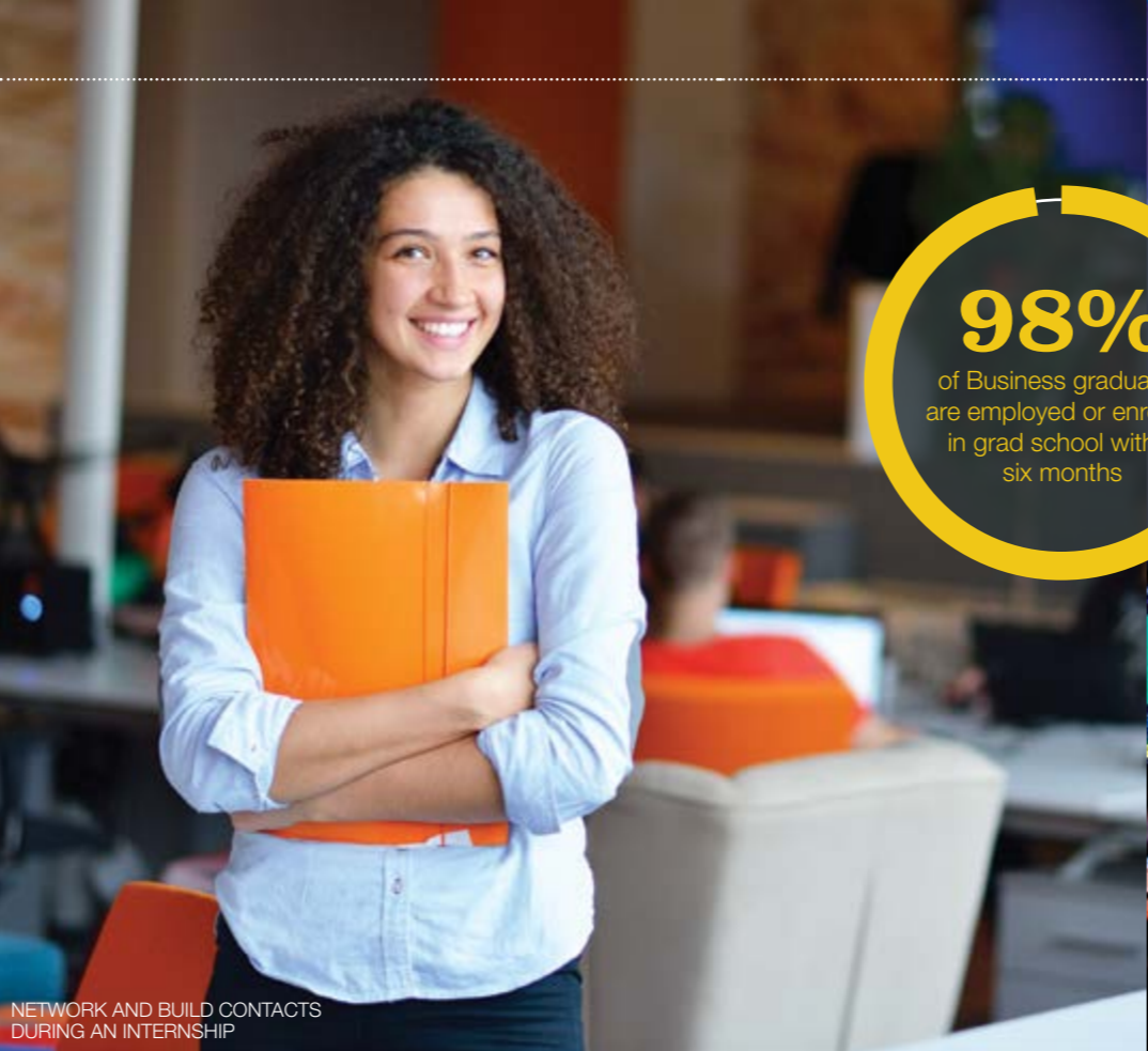
NETWORK AND BUILD CONTACTS DURING AN INTERNSHIP

Quinnipiac students undertake a wide variety of internships. The School of Business co-sponsors more than 150 internships that offer first-hand experience in a business environment. Business students have interned at organizations as varied as Pfizer, NBC Sports and the Cannes Film Festival. Most students in the School of Communications complete a 120-hour internship for academic credit. Communications students have access to more than 1,000 field placements across the USA in the broadcast, media, and sound recording industries.