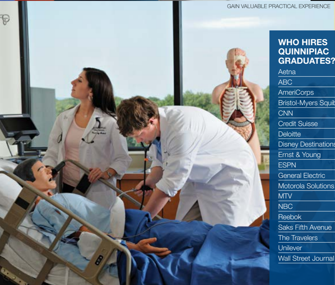
GAIN VALUABLE PRACTICAL EXPERIENCE