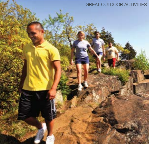
GREAT OUTDOOR ACTIVITIES