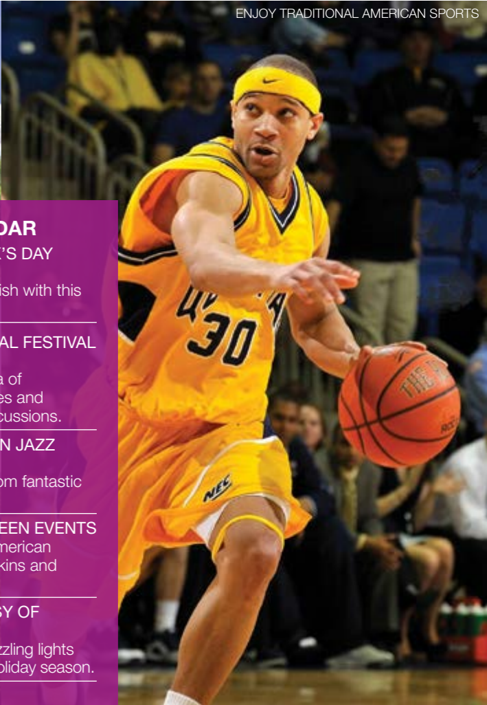
ENJOY TRADITIONAL AMERICAN SPORTS