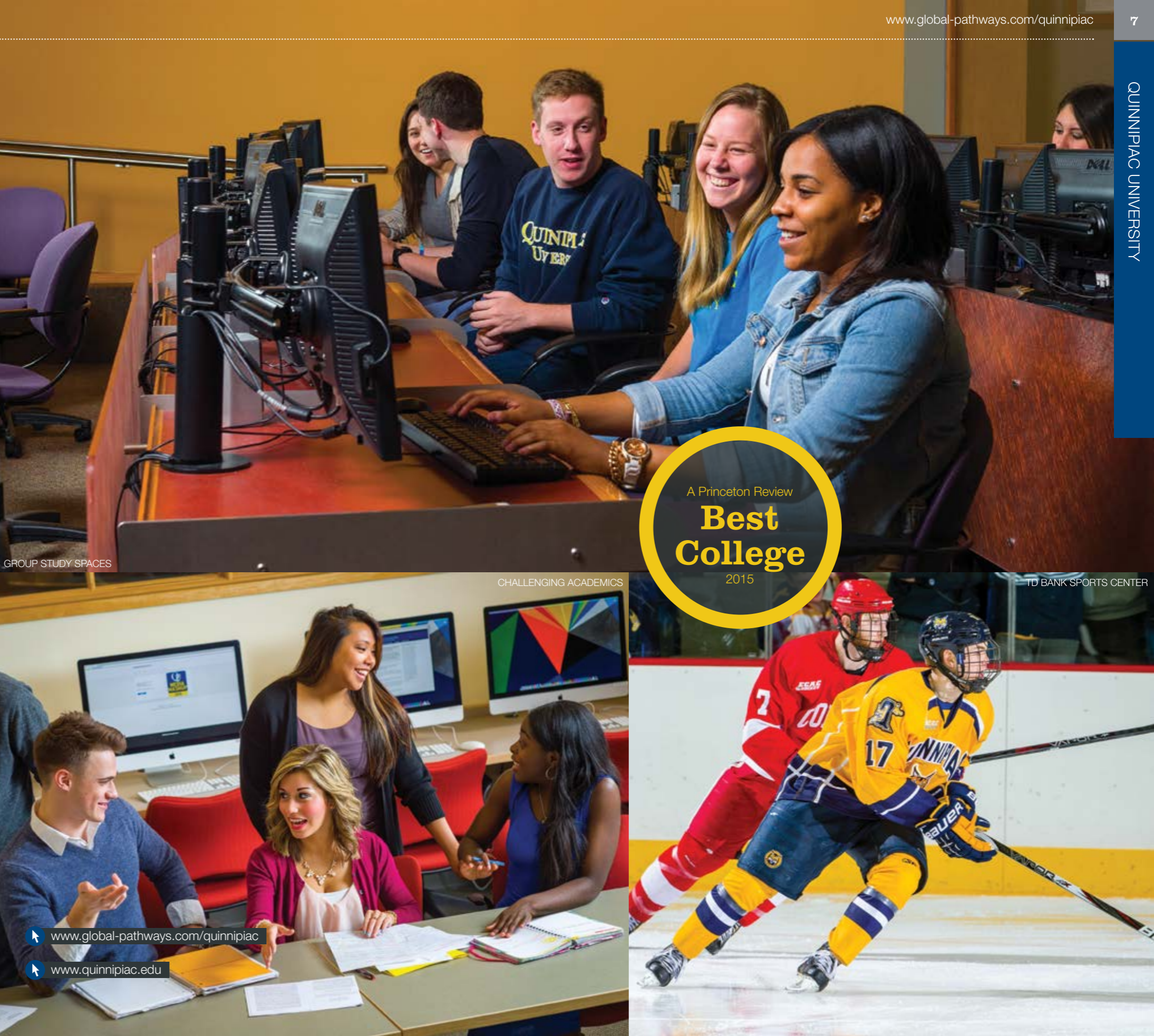
GROUP STUDY SPACES

Facilities at Quinnipiac are designed to provide industry-specific experience. The Mass Communications Center is equipped with professional-level television and audio recording studios, digital video editing suites, and a high-definition television studio, modeled on a working newsroom. Health Sciences students will have the opportunity to use cutting-edge equipment for the study of orthopaedics, clinical skills, and physical diagnostics. The School of Business features a impressive professional-grade financial technology center and trading floor.