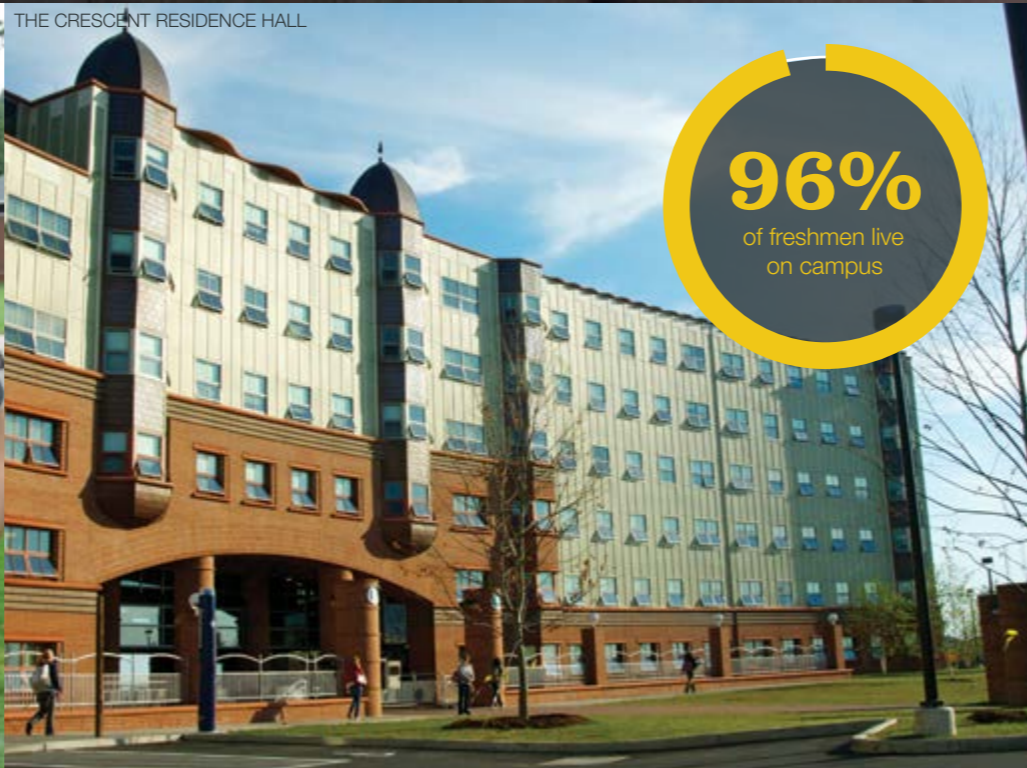
THE CRESCENT RESIDENCE HALL