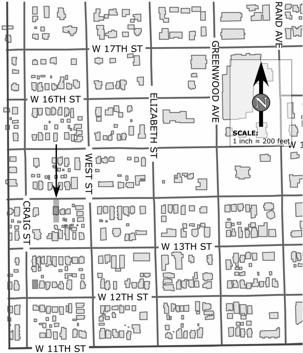
SITE SKETCH MAP