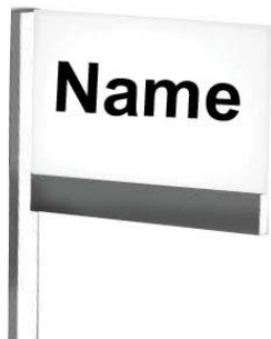
Blade ID Sign 11" High x 17" Wide

A - 1M Panel - 38 1/8" wide x 67 5/8" high Visual Opening - 37 9/16" wide x 65 1/2" high