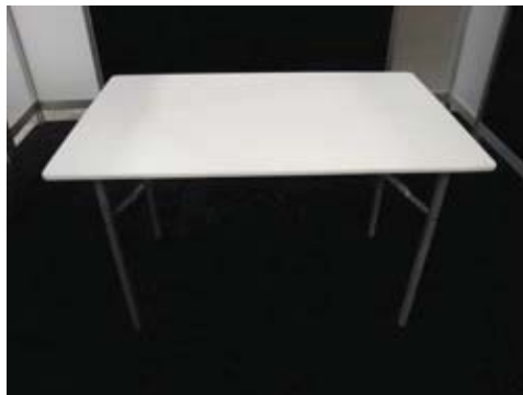
White Table 48" Wide x 30" Deep x 30" High