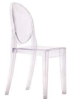
Wendy Chair 19.7" Deep x 15" Wide x 35.8" High