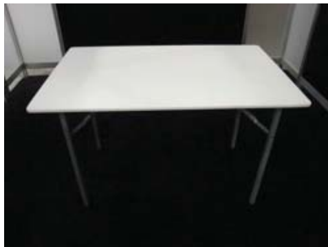
White Table 48" Wide x 30" Deep x 30" High