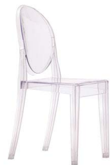
Wendy Chair 19.7" Deep x 15" Wide x 38.8" High