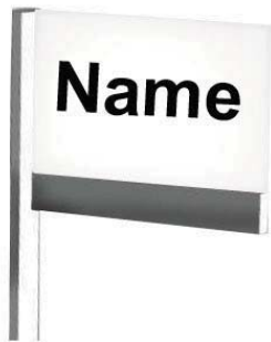
Blade ID Sign 11" High x 17" Wide

A - 1M Panel - 38 1/8" wide x 67 5/8" high Visual Opening - 37 9/16" wide x 65 1/2" high