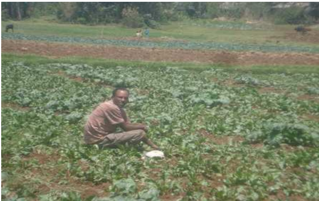
Figure 4 Low quality production because of lack of extension service