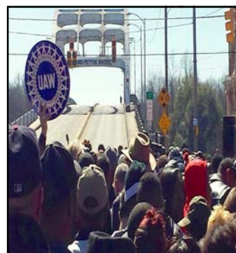
Crossing the Edmund Pettus Bridge

day as we commemorate the 50 th anniversary of the Selma to Montgomery march and the Voting Rights Act of 1965, I am also reminded of those brave foot soldiers, I affectionately call them. Seeking God's will for such a worthy and yes worldly