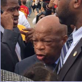
Congressman John Lewis in Selma Alabama