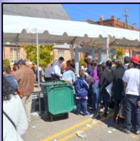
Security Check to see President Obama

The Department of Labor numbers do not reflect the total number of UAW members. Members not reflected in these numbers include those newly organized in the process of bargaining a first contract and those in the academic sector who are represented by the UAW but have not yet signed membership cards. Including those union members in the total brings the number to well over the reported 403,466 for 2014.