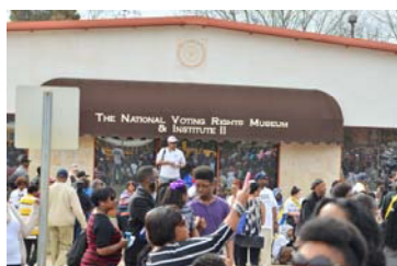
The National Voting Rights Museum