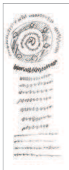
First stage: thumbnail sketches