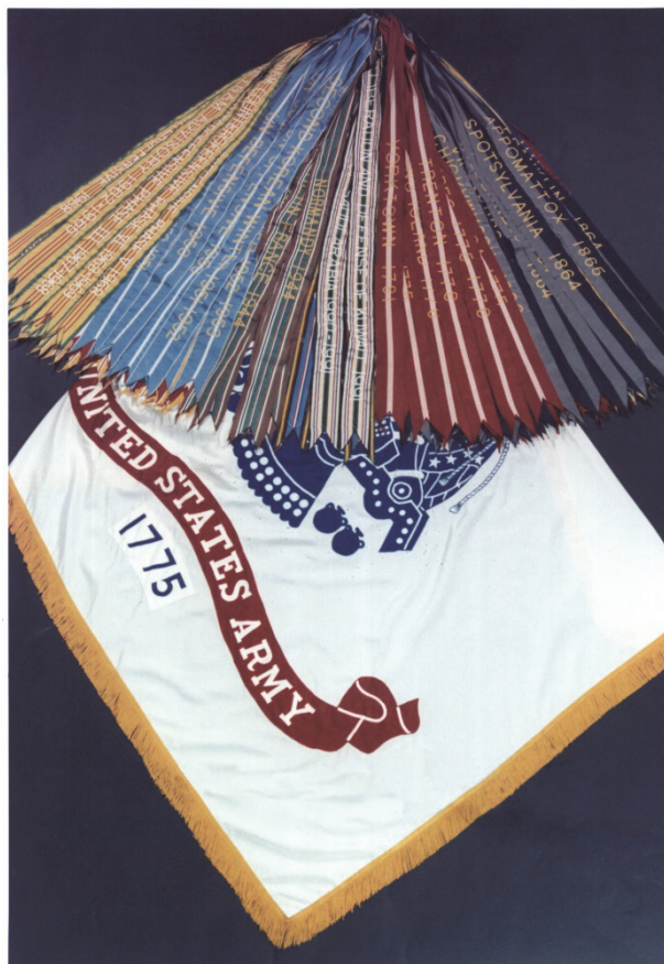
Figure B-1. The Army flag with streamers

Δ B-1. The Army's history is reflected in the battle and campaign streamers that adorn the Army flag. The Army flag honors all who served and are serving, reminding each American that our place today as the world's preeminent landpower was not achieved quickly or easily but built on the sacrifices from the Revolution through today. Additional information about these campaigns is available on line at http://www.army.mil/symbols/flag.html .