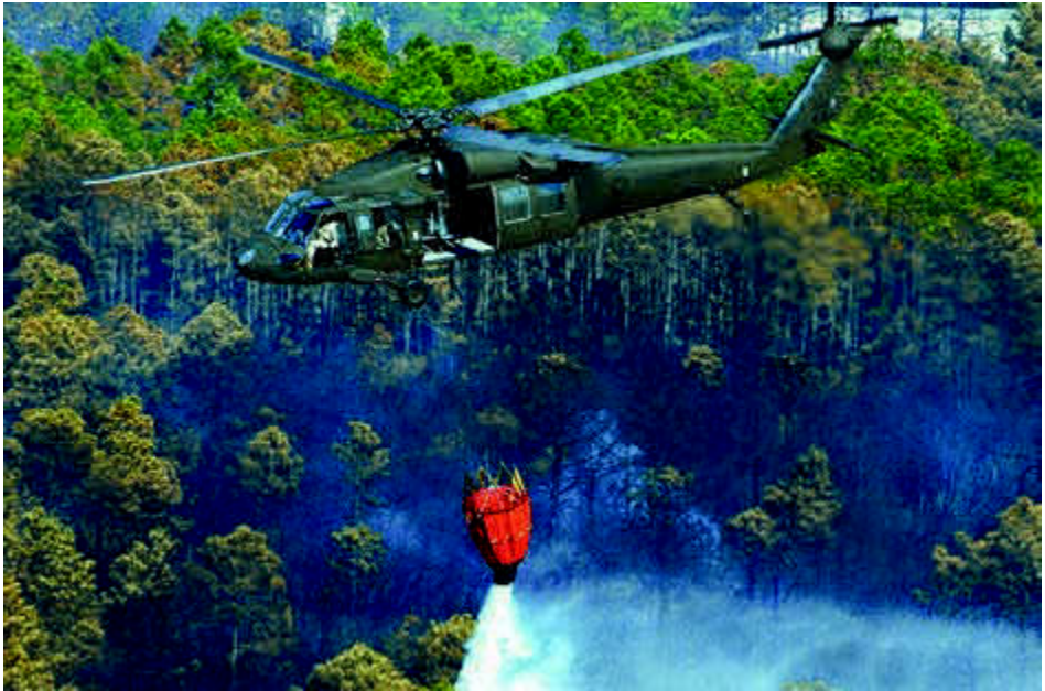
Figure 4-2. An Army National Guard helicopter supports firefighters