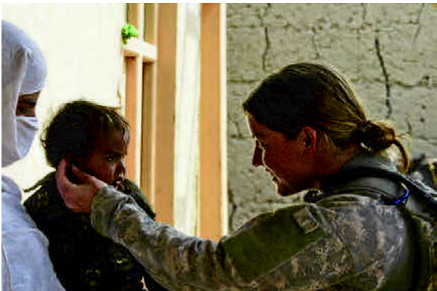
Figure 1-2. Landpower makes permanent the temporary effects of battle

1-9. No major conflict has ever been won without boots on the ground. Strategic change rarely stems from a single, rapid strike, and swift and victorious campaigns have been the exception in history. Often conflicts last months or years and become something quite different from the original plan. Campaigns require steady pressure exerted by U.S. military forces and those of partner nations, while working closely with civilian agencies. Soldiers not only seize, occupy, and defend land areas; they can also remain in the region until they secure the Nation’s long-term strategic objectives. Indeed, inserting ground troops is the most tangible and durable measure of America’s commitment to defend American interests. It signals the Nation’s intent to protect friends and deny aggression.