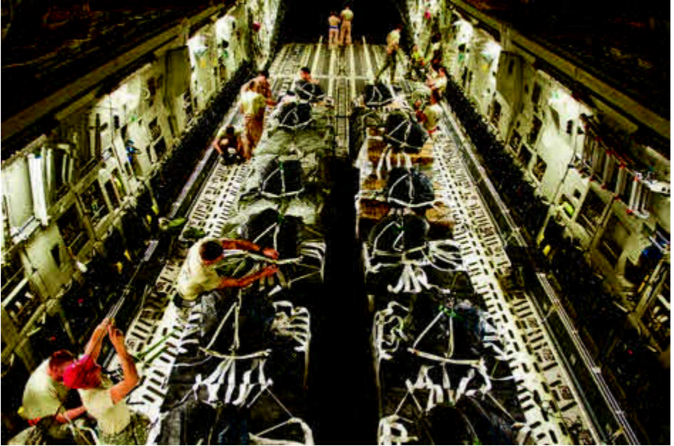
Figure 3-2. Army riggers prepare supplies for airdrop from a C-17

group is at home. Consequently, the Army deploys fewer Soldiers today to theater as replacements for casualties than were deployed in the past.