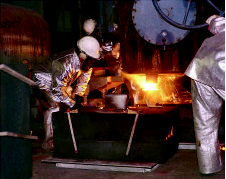
Figure A-2. Army Civilian Corps members

A-7. The Army has the largest civilian workforce in the Department of Defense. Army Civilians are full-time, long-service members of the profession. The Army Civilian Corps provides the complementary skills, expertise, and competence required to project, program, support, and sustain the uniformed side of the Army. Title 5, USC, governs the Army Civilian Corps.