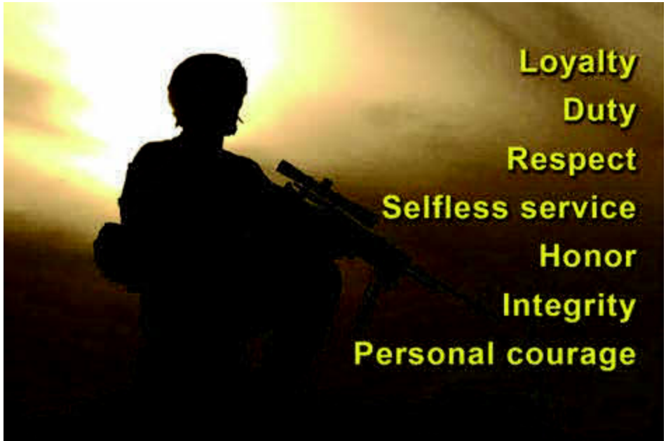
Figure 2-2. The Army Values