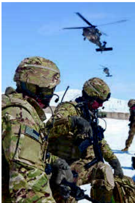
Introductory Figure. Soldiers—the strength of the nation

During the first year of the American Revolution, on 14 June 1775, the Second Continental Congress established “the American Continental Army.” The United States Army is the senior Service of the Armed Forces. As one of the oldest American institutions, it predates the Declaration of Independence and the Constitution. For almost two and a half centuries, Army forces have protected the Nation. Our Army flag is adorned with over 180 campaign and battle streamers, each one signifying great sacrifices on behalf of the Nation. Because of the Army, the United States is independent and one undivided nation. The Army explored the Louisiana Purchase, ended slavery on the battlefields of the Civil War, helped build the Panama Canal, played a major part in winning two world wars, stood watch throughout the Cold War, deposed Saddam Hussein, and took the fight to Al Qaeda.