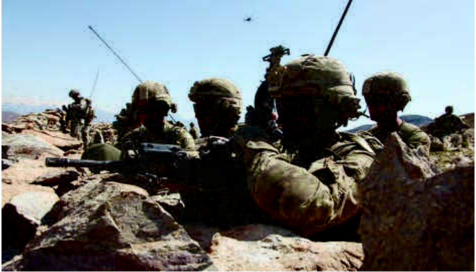
Figure A-1. Army National Guard Soldiers in Afghanistan

A-5. The Army National Guard is also an operational reserve for the Regular Army. When ordered to active duty, these Soldiers become subject to the Uniform Code of Military Justice and come under the command of the combatant commanders. Army National Guard forces are organized and equipped identically with like units in the Regular Army and Army Reserve. The Department of the Army provides their equipment and much of their funding and is responsible for assessing the combat readiness of the Army National Guard. However, Title 32, USC, provides the states with latitude in recruiting, manning, and training.