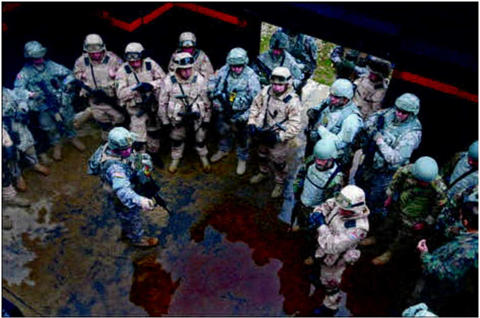
Figure 1-3. American Soldiers training with Croatian forces

1-14. Soldiers are particularly important in this effort, since all nations have land security elements, even if lacking credible air and naval forces. To the degree that other nations see us as the best army in the world, they gravitate to us to help them achieve the same high standards of military performance, or tie their security to the world's most capable army. Soldiers deploy around the world to train with security forces of other nations. Army special operations forces carry out a significant part of this effort; however, conventional units frequently train with foreign counterparts. Concurrently, our Soldiers and Army Civilians train foreign military personnel at Army bases. This unobtrusive use of landpower quietly builds multinational partnerships that may be critical in war. It increases our partners' capacities to provide for their own defense and is vital to ensuring we have access to regional bases should Army forces have to deploy to their region.