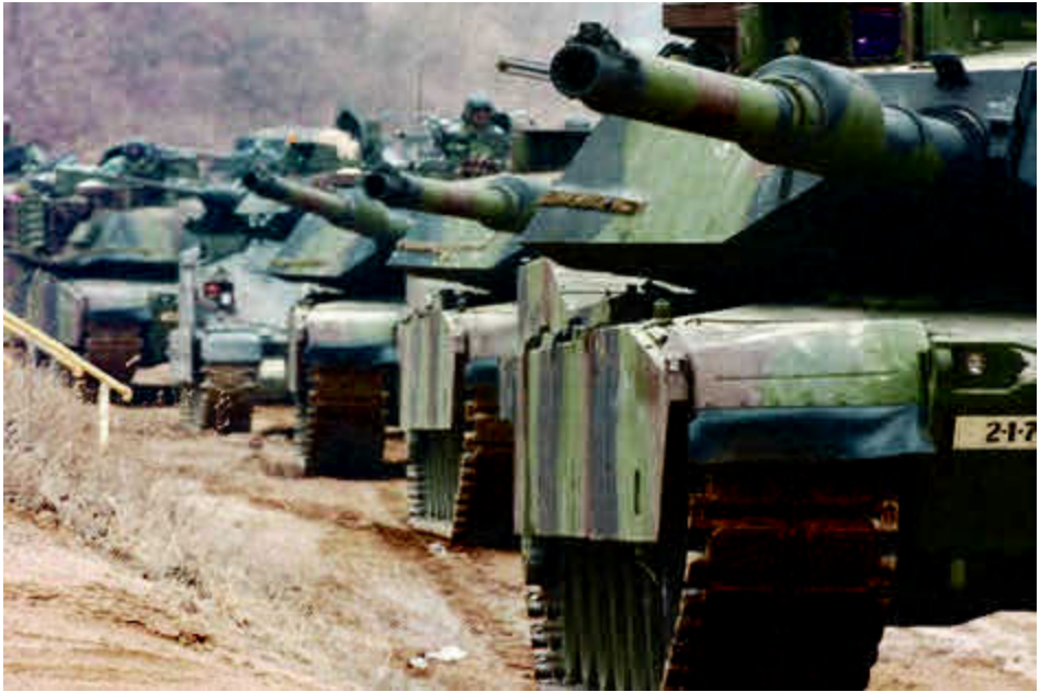
Figure 3-1. Combined arms maneuver