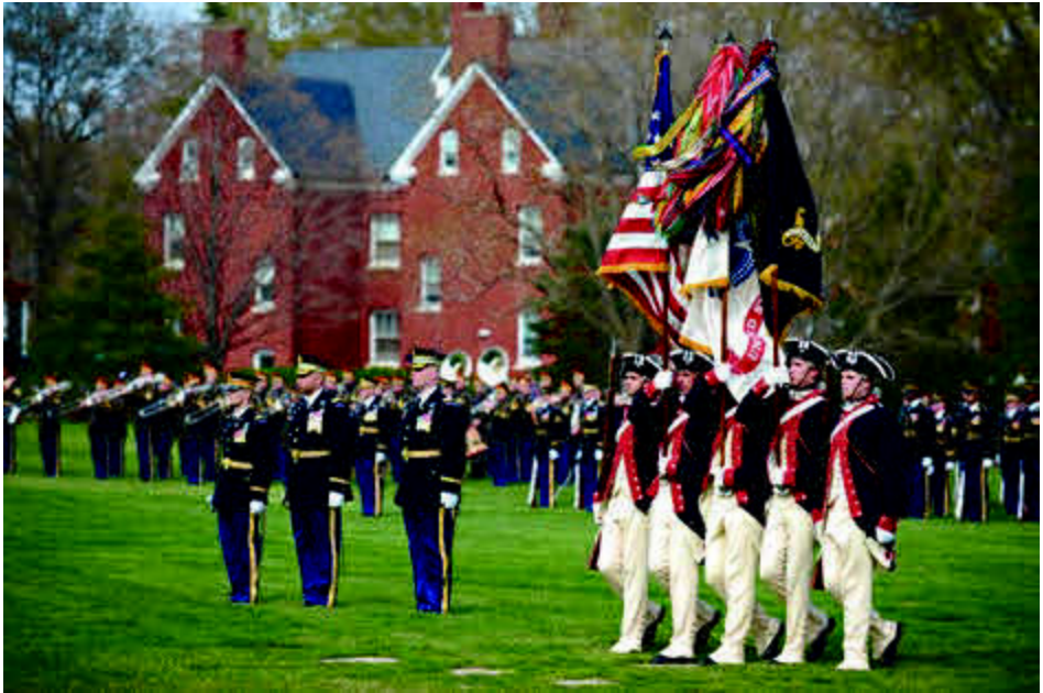
Figure 2-4. Esprit de corps reflected in our customs and ceremonies

to do the harder right instead of the easier wrong. Pride stems from an internalized recognition that obstacles, adversity, and fear can be mastered through discipline and teamwork. Discipline and pride go together with judgment, expertise, and experience to create military and civilian professionals.