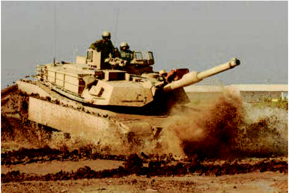
Figure 2-3. Initial certification—crewmembers learn to operate the M1A1 tank