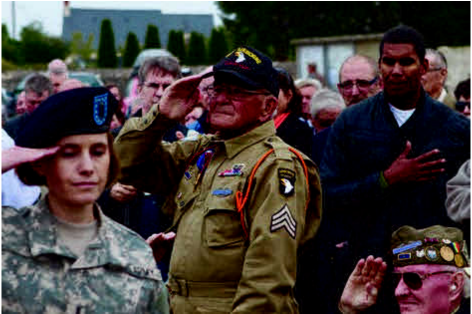
Figure 4-3. Soldiers for life

4-21. Today less than one-half of one percent of Americans serves in the military, and only about half of them are Soldiers. Being a Soldier is far more than a job; it is a calling, a vocation. Former Chief of Staff of the Army Eric Shinseki, although badly wounded in Vietnam as a young officer, always said, "Soldiering is an affair of the heart," a phrase he adopted from General Abrams. Taking off the uniform does not mean the end of pride in one's service to the Nation. It means taking that pride, discipline, and confidence into other areas, and never forgetting that each veteran will always be part of a proud tradition of sacrifice and service.