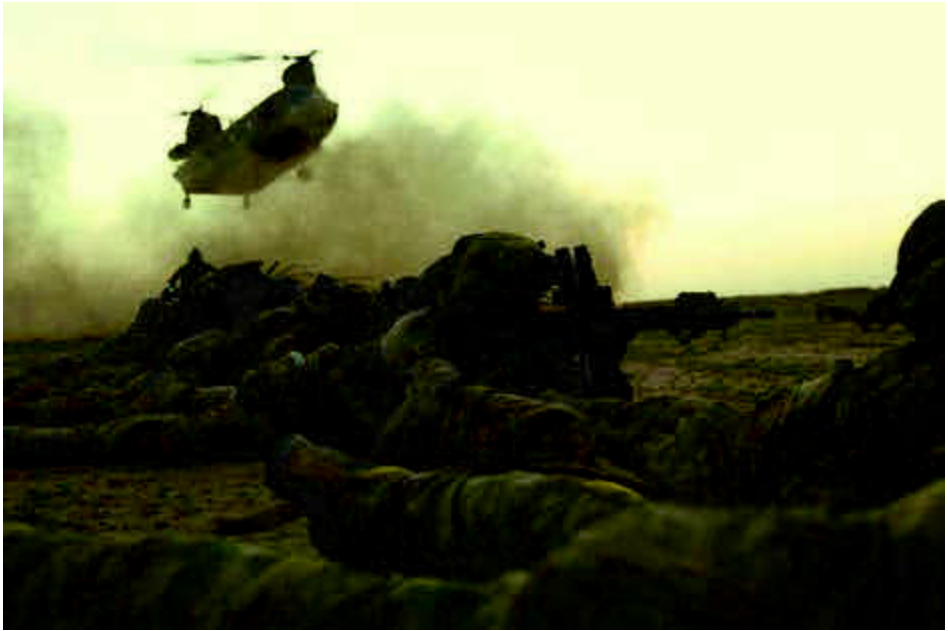
Figure 4-1. Air assault in Afghanistan