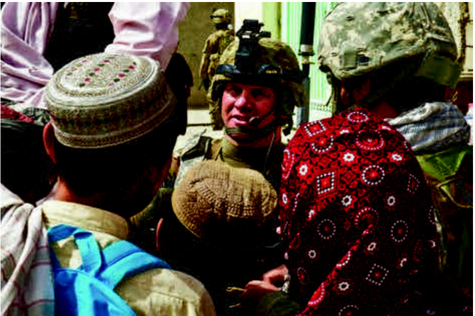
Figure 1-1. The environment of land operations

government partners (intergovernmental), and military forces from partner nations (multinational). The basic premise of unified land operations is that Army forces combine offensive tasks, defensive tasks, stability tasks, and defense support of civil authorities (DSCA) in concert with joint, interagency, intergovernmental, and multinational partners. Army operations conducted overseas combine offensive, defensive, and stability tasks. Within the United States, we support civil authorities through DSCA. If hostile powers threaten the homeland, we combine defensive and offensive tasks with DSCA. The effort accorded to each task is proportional to the mission and varies with the situation. We label these combinations decisive action because of their necessity in any campaign.