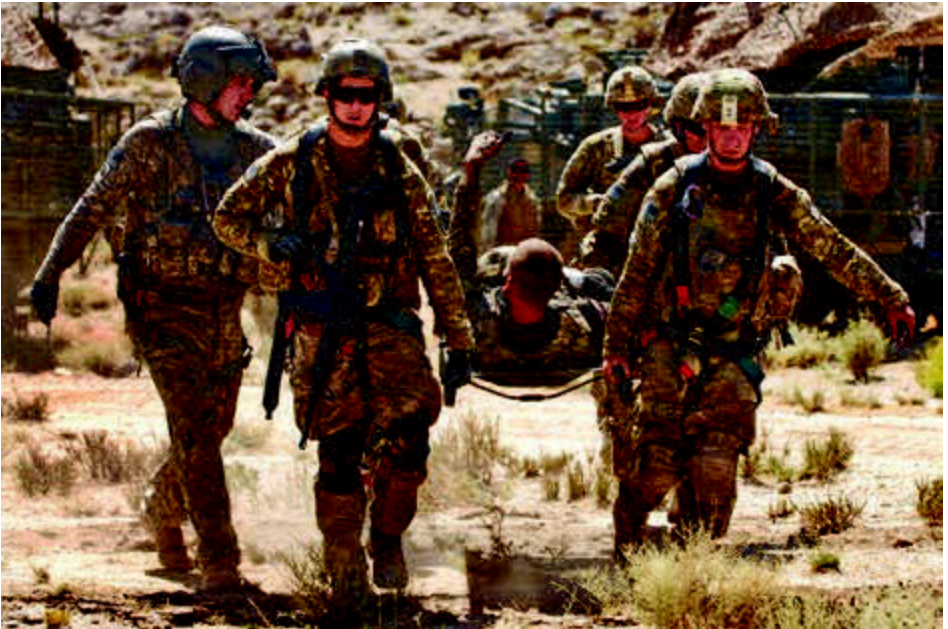
Figure 2-1. “Thumbs up!”—a profession built on trust

The Army has a dual nature—it is both a military department (a part of the Armed Forces) and a military profession. As one of the Nation’s armed services, we carry out the missions assigned to us by the Commander in Chief in accordance with the law and intent of Congress. As a unique military profession, the Army is built upon an ethos of trust, which buttresses four other essential characteristics of our profession: military expertise, honorable service, esprit de corps, and stewardship. The Army Profession: 2012, After More than a Decade of Conflict provides an in-depth review of Army professional responsibilities.