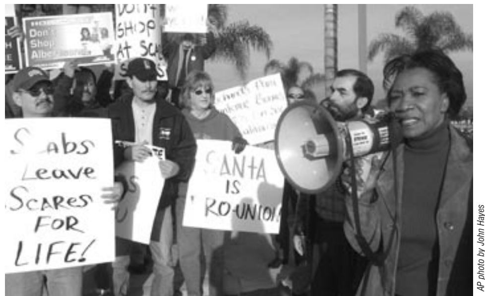
Juanita Millender-McDonald speaking to striking and locked out grocery workers in front of a hotel housing scabs, Dec. 2003.

1991-1992. She served as an educator in the Los Angeles schools and as a member of the state assembly between 1993-1996. She won election to the 104th Congress by special election to fill the vacancy caused by the resignation of Representative Walter Tucker III. Her 37th District voters reelected her to six terms from March 1996 until last November, when she received 82 percent of the vote. She served as the first African American woman to chair the Committee on House Administration.