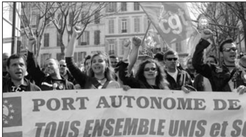
French dockers march through the streets of Marseille.

Dockers at the southern French port of Marseille continued their long tradition of militancy and beat back recent attempts to privatize their jobs.