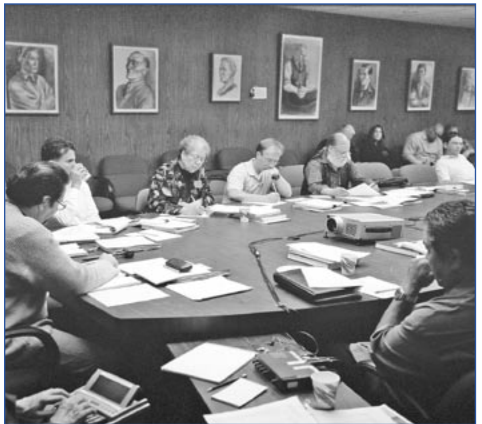
IEB getting down to business.