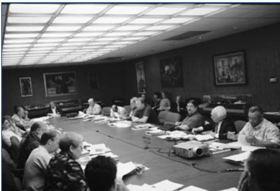
IEB studying motions.

BE IT RESOLVED that the ILWU go on record that it protests the recent action by Circuit City in firing its higher paid workers and replacing them with lower paid ones, and BE IT FURTHER RESOLVED that the ILWU urge its members to boycott Circuit City until it reverses this anti-worker and inhumane policy.