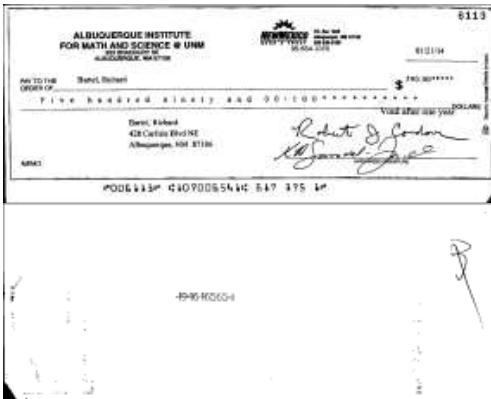
Check 6113 Amount $590.00 01-28-14