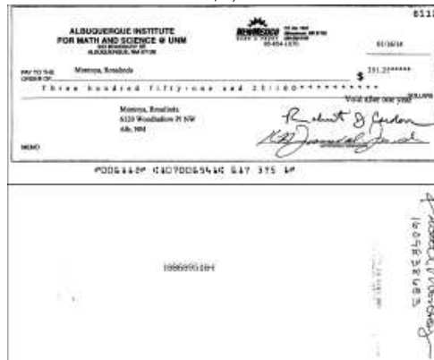
Check 6112 Amount $351.25 01-22-14