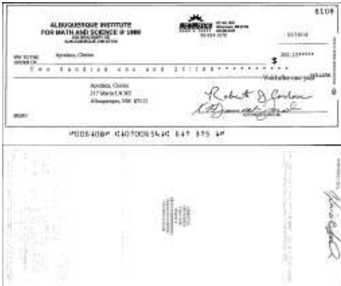
Check 6108 Amount $201.25 01-21-14