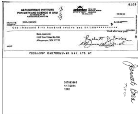
Check 6109 Amount $1,512.04 01-21-14