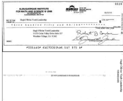
Check 6115 Amount $350.00 01-29-14