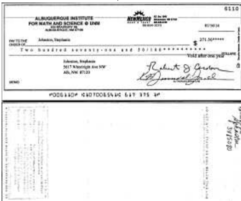
Check 6110 Amount $271.50 01-23-14