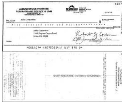
Check 6107 Amount $9,000.00 01-22-14