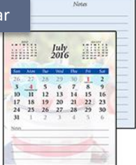
Calendar Page front & back