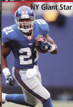
NY Giant Star