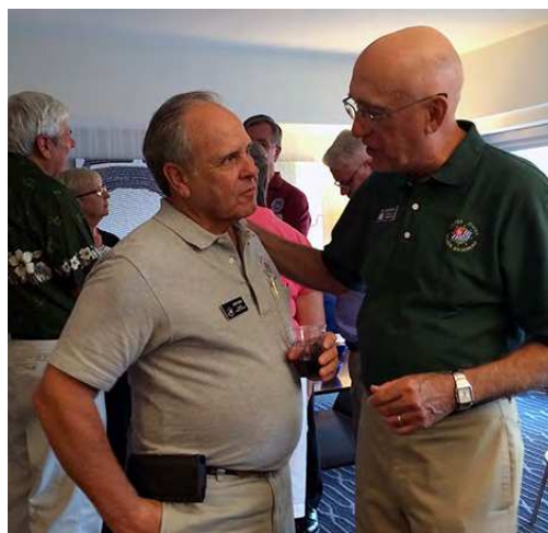
Is D/C Bill giving NExO Louie tips on how to run USPS next year?