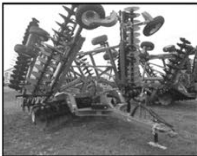
2013 John Deere 2623 Buy It Now!! $58,000 33'7", Tandem Disk, 24" Blade, 3 Bar Harrow, Self Adjusting, Scrappers Wagner, SD - #145687