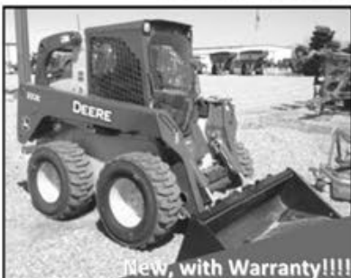
2013 John Deere 332E Buy It Now!! $49,500 Skid Steer Loader, 100 HP, Switchable Joystick Controls Mitchell, SD - #159187

VISIT OUR WEBSITE: www.deerequipment.com • Check on Clearance Center link!