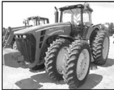
2007 John Deere 8430 Buy It Now!! 165,000 305 HP 250PTO, Power Shift, Deluxe Comfort Package, 2195 eng hrs. Wagner, SD - #164186