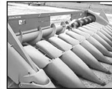
2008 John Deere 612C Buy It Now!! $65,000 12R20 Stalkmaster, knife Rolls, HYD Deck Plates, PTO Telescoping Drive Wagner, SD - #164519