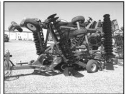
2013 John Deere 2623VT Buy It Now!! $43,000 Disc Blades 22" x 197", SP/WV, 2.75" Pins, .25" Front Blades/new Yankton, SD - #150440

VISIT OUR WEBSITE: www.deerequipment.com • Check on Clearance Center link!