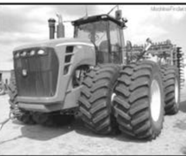
2008 John Deere 9530 Buy It Now!! $220,000 475 HP, 4 SVCS, Power Diff Lock, Active Seat, Autotrac Ready, 2252 eng hrs. Mitchell, SD - #167266