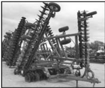
2004 John Deere 637 Buy It Now!! $29,000 37'10" Tandem Disk, 9" Spacing, 3 Bar Harrow, HYD Fore/Aft Mitchell, SD - #162934