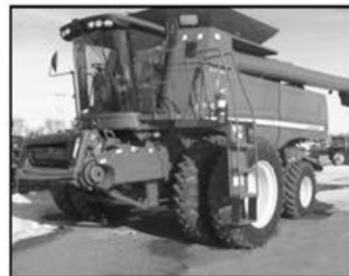
2008 John Deere 9770 STS Buy It Now!! $138,000 360 HP, 2WD, Hydro, Contour Master, Hi-Torque FH Drive, 1660 eng/1179 sep hrs. Mitchell, SD - #156399