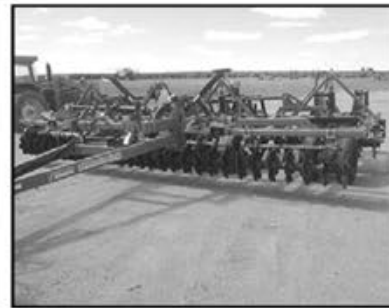
2012 Summers 9J2300 Buy It Now!! $38,000 Like New! 3-Section Folding, Super Coultter Wagner, SD - #155563