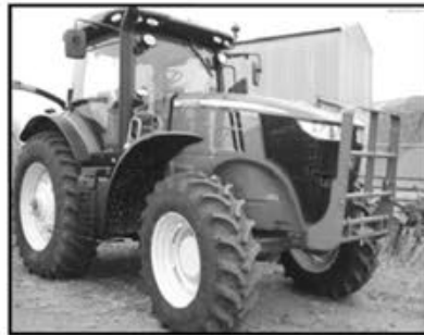
2013 John Deere 7200R Buy It Now!! 131,000 Autoquad Plus with RHR, Deluxe Cab, 3 Rear 32 GPM Hydraulic Pump, 51 eng hrs. Yankton, SD - #159930