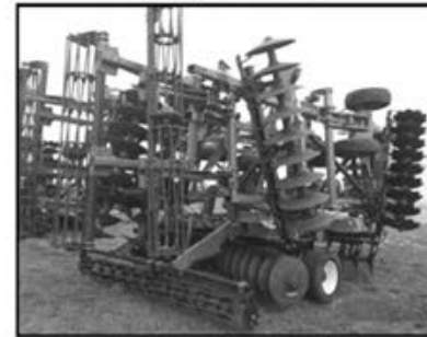
2012 John Deere 2625 Buy It Now!! $81,000 40'8" Tandem Disk, 26" Blade, 11" Spacing, HYD Wing Control Wagner, SD - #133029