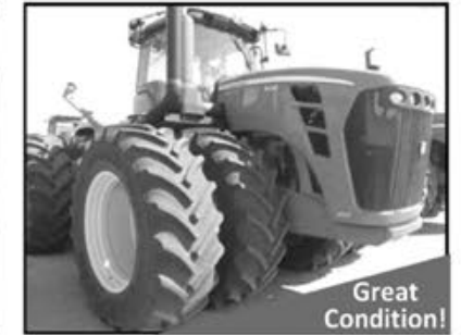
2009 John Deere 9430 Buy It Now!! $228,000 425 HP, 18F/6R Powershift, 30 GPM HYD, Power Diff Lock, Active Seat, 1669 eng hrs. Mitchell, SD - #158056