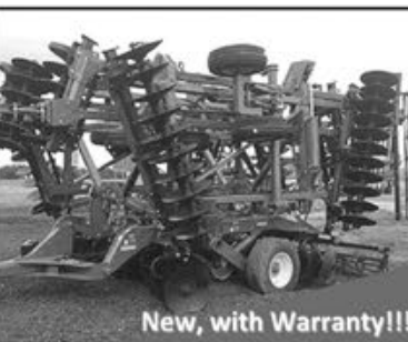
2012 John Deere 2623 Buy It Now!! $69,000 36'5", Tandem Disk, 24" Blade, Rolling Basket, HYD Fore/Aft, Single Point Depth Freeman, SD - #145220