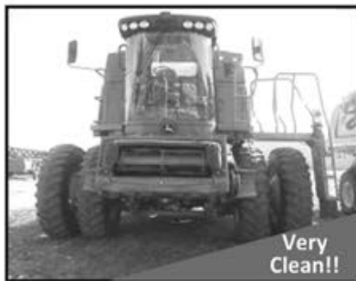
2009 John Deere 9770 STS Buy It Now!! $145,000 Hydro, Contour Master, Hi-Torque, Harvest Monitor, 1375 eng/943 sep hrs. Yankton, SD - #159217