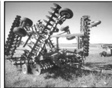
2007 John Deere 637 Buy It Now!! $37,000 32'1" Tandem Disk, 23" Blade, 9"F/11"R Spacing, Self Adjusting Scrappers Yankton, SD - #156380