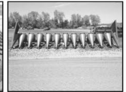
2000 John Deere 1293 Buy It Now!! $14,000 12R30, Non-Chopping, Knife Rolls, HYD Deck Plates, PTO Telescoping Drive Mitchell, SD - #154576