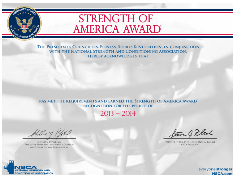
Example of the NSCA Strength of America Award certificate

The NSCA will provide each winning school a press release that can be distributed to local media outlets.