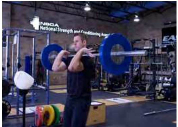
Example of a lifter with bumper plates