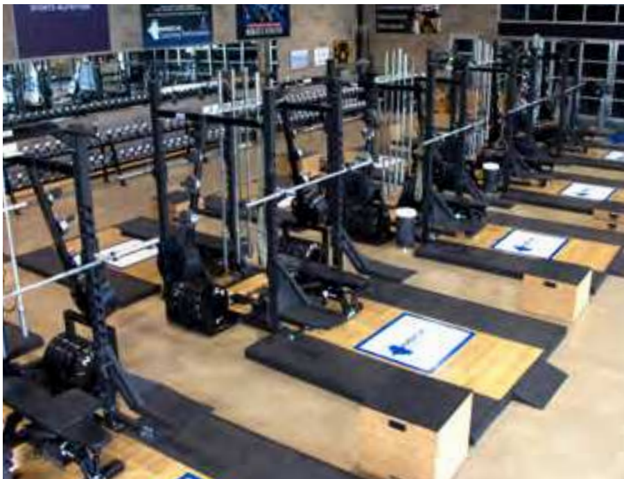
Example of a properly set up weight room

From the NSCA Essentials of Strength Training and Conditioning :