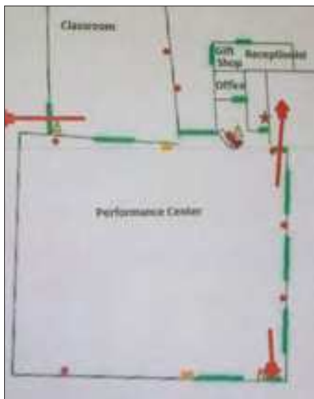
Example emergency evacuation map