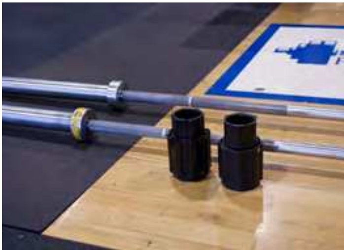
Example of weight bar and collars