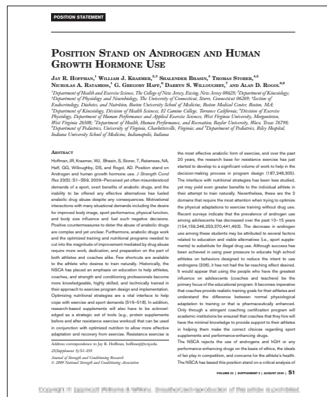
Position Stand on Androgen and Human Growth Hormone Use