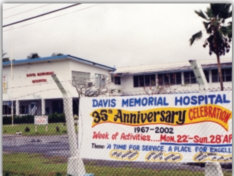
Davis Memorial Hospital celebrates 35 years