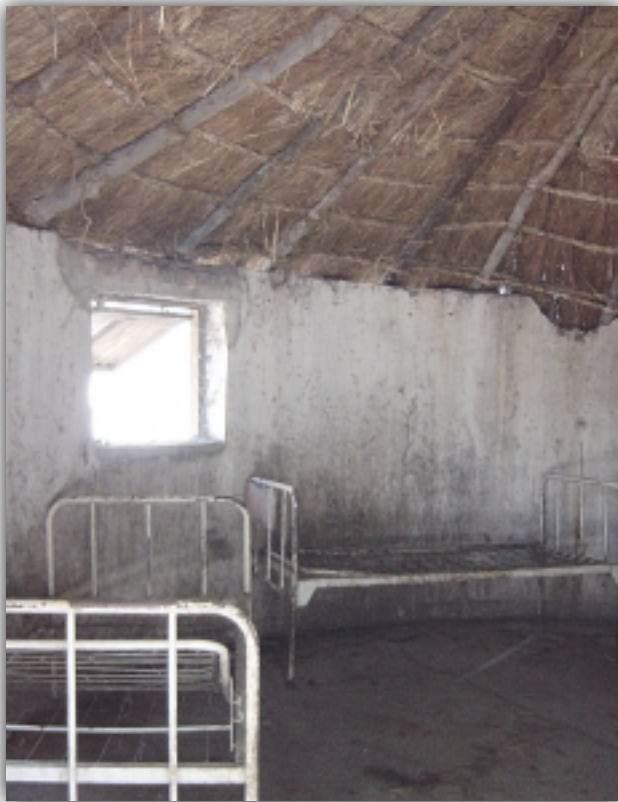
Hospital room in Bere, Chad

his family in Yaounde to begin this project. Plans are now underway to have his two oldest children go to boarding academy and his wife and youngest will join him at Bere. He has already gained the confidence of the World Bank consultants and the Ministry of Health officials and is ready to move forward.