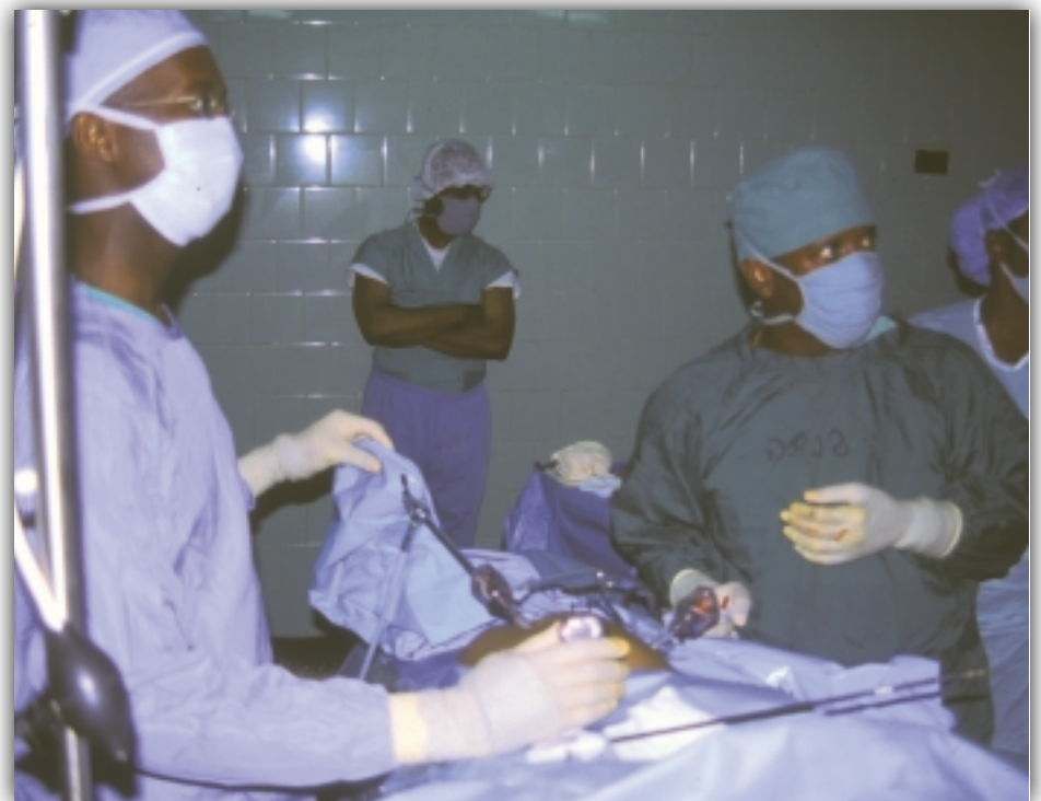
Laparoscopic surgery in Guyana after electrical systems are repaired

Almost $500,000 has been received from Hope for Humanity in the past two years for AHI projects. This has been absolutely crucial for the wide variety of projects that AHI has undertaken in its member institutions. The next time you hear about Ingathering: Hope For Humanity, remember all that it accomplishes and look for ways to participate in its important ministry.