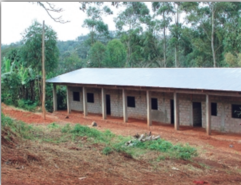
Developing a mother and child center in Cameroon

The final goal in the country is to offer health science training programs at the new university. The government has approved this plan in general and specific plans to start with a nursing school are being considered. This will require additional buildings and faculty. Koza, Batouri, and Buea can all be included in these rotations with careful planning of the curriculum and scheduling.