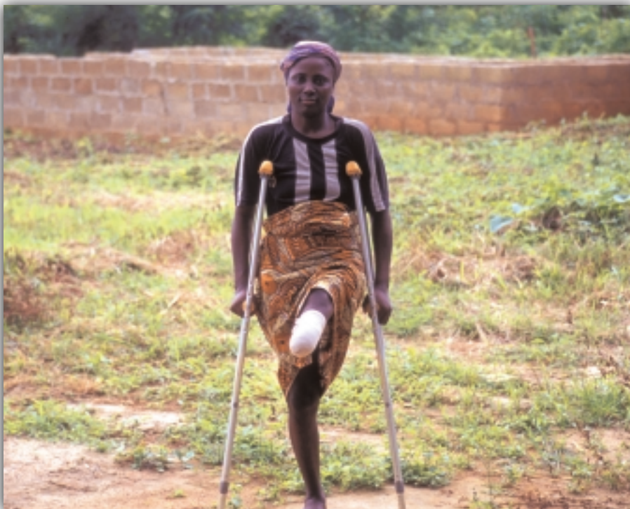
A patient at Ile-Ife Hospital

Finally, two years ago, just as Nigeria was joining AHI, the decision was made to finally start the residency program. Encouragement was given when some of the government teaching hospitals also asked to rotate residents at Ife, recognizing the quality of specialists that were there. The first resident dropped out after