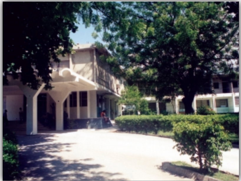
The entrance of Hopital Adventiste d'Haiti