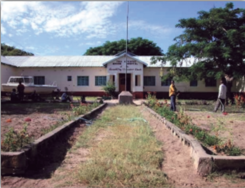
Entrance to Yuka Hospital in Western Zambia

The new Lusaka Eye Hospital continues to actively build a very positive reputation