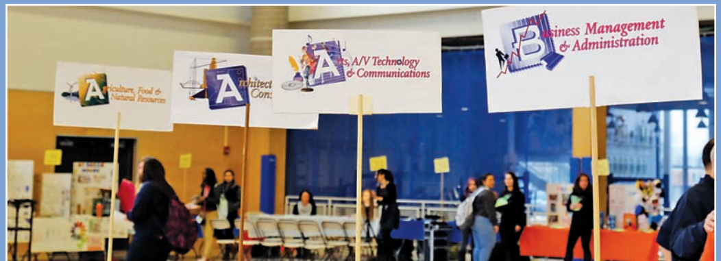
Before registering for classes for the 2016-2017 school year, students had the opportunity to explore the wide variety of curriculum offerings at Stagg High School at our yearly Curriculum Fair.