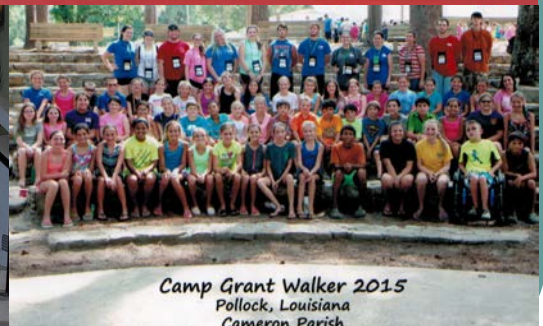
Camp Grant Walker 2015 Pollock, Louisiana Cameron Parish