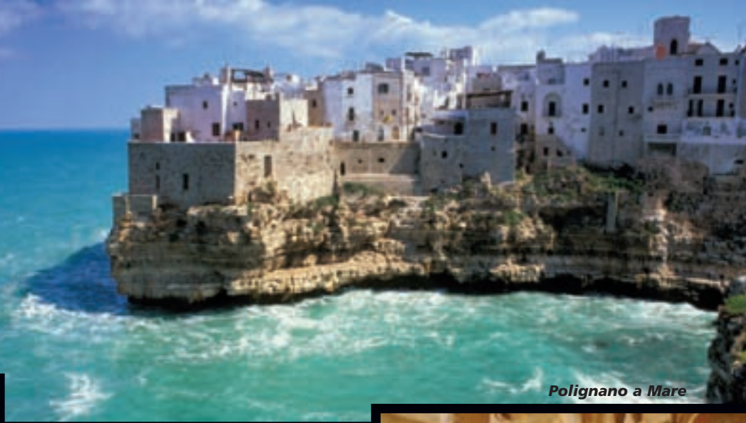
Polignano a Mare