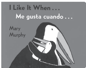
I Like It When... (Me Gusta Cuando...)