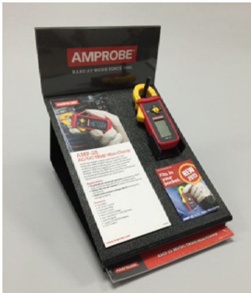
AMP-25 POP Display