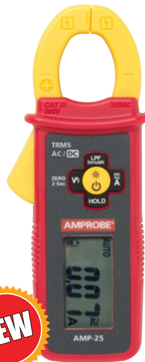
AMP-25 Mini Clamp