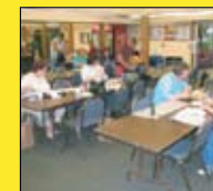
400 Seat Cash Bingo Hall