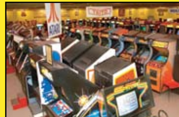
Huge Collection of Arcade Classics