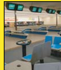
20 Lane Bowling Center