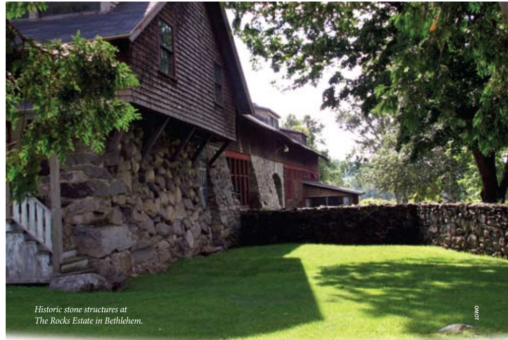
Historic stone structures at The Rocks Estate in Bethlehem.

MOUNT WASHINGTON OBSERVATORY 2279 White Mountain Hwy., North Conway 03860. Observing extreme weather atop the Northeast's highest peak for 75+ years. Visit the summit museum for a look at the geology and human history of the mountain. Don't miss the science and weather museum! Become a member today! 800-706-0432 or www.mountwashington.org