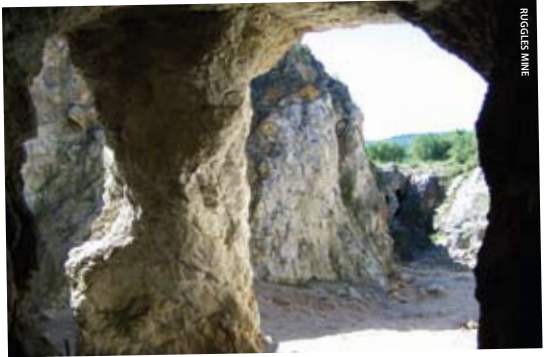
The view from inside Ruggles Mine.

events are scheduled for this summer—see Events beginning on page 77. Please visit www.flyingyankee.com for more information regarding the restoration of the Flying Yankee .