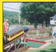
Outdoor Mini Golf