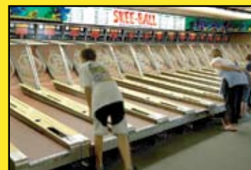
Over 500 Games for All Ages