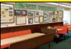
Braggin' Dragon Restaurant

Your Family Entertainment Super Center Since 1952!