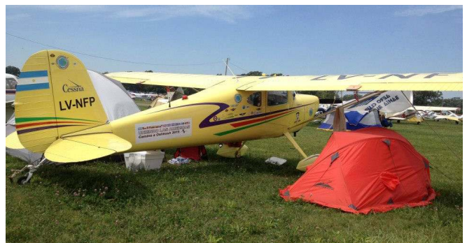
This Cessna 140 came all the way from Argentina—at a cruise speed of about 100 miles per hour.

Informational forums and hands on workshops had a total of 1,048 sessions attended by 75,000 people. The International Visitors Tent had 2,299 visitors registered from 80 nations, there were 970 media representatives on site from five continents, and EAA's 1,000 photo uploads were viewed nearly 8,000,000 times.