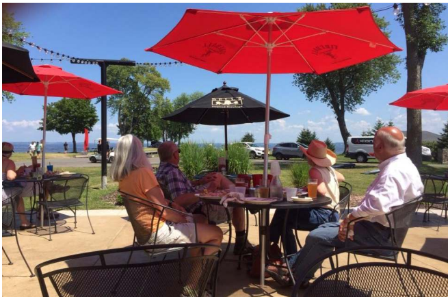
Lunch at the waterfront restaurant.