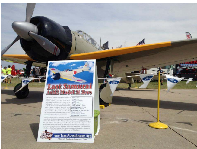
Some very rare (war) birds at Oshkosh. Here, one of the last Japanese Zeros of World War II still flying.

Though started in 1953 by a small group of people who came together with a common interest in constructing their own airplanes, the EAA has evolved into a large organization covering all aspects of aviation. Like the WBCCI's "Vintage" or "Classic" intra clubs, the EAA has divisions for Ultra Lights, Antique, Vintage, Warbirds, Aerobatics, etc. There are many local Chapters, technical advisors to assist homebuilders, flight advisors, as well as a Washington D.C. staff for Advocacy and Government Relations just to name a few of the organizations activities.