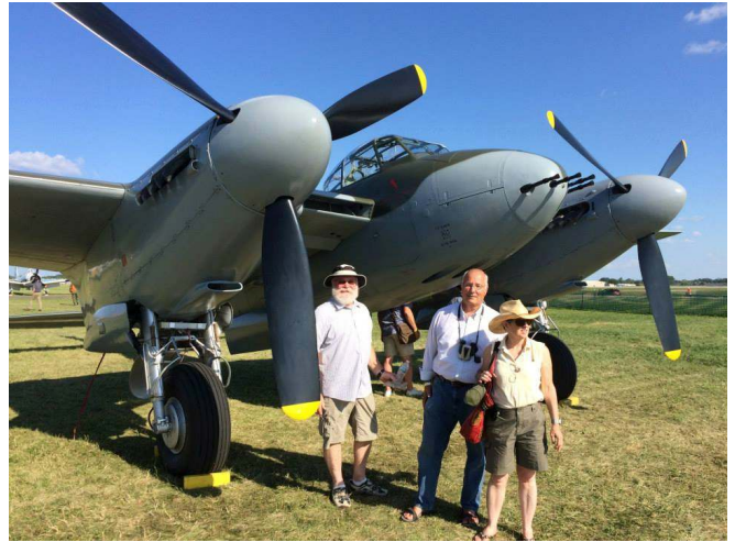
WW II British de Havilland Mosquito bombers. One of two still flying.