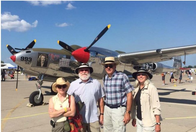
Our gang in front of a WW II P-38.

A small contingent of the Wisconsin Unit attended the Experimental Aircraft Association's annual fly-in, dubbed Airventure, which is held every year at Wittman Regional Airport in Oshkosh Wisconsin. Everyone in the world that is involved in aviation knows about "Oshkosh", as the fly-in is known, and it's on their bucket list to attend at least once in their lifetime.