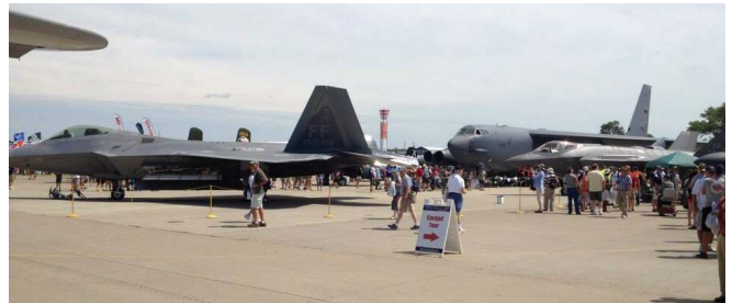
B-52, F-22, and F-35 all in one picture. Only at Oshkosh!

Airventure is EAA's annual convention - like WBCCI's International Rally. Some of the numbers for this years convention include: attendance of approximately 550,000 people, 10,000 aircraft arrived at Wittman field and nearby airports, there were 16,200 aircraft landings at Oshkosh, on Thursday alone there were 3,100 aircraft movements (takeoffs and landings) in 14 hours, 2,668 show planes attended including - 1,031 homebuilt aircraft, 976 vintage airplanes, 350 warbirds, 130 ultralights and light-sport aircraft, 101 seaplanes, 30 rotorcraft, and 50 aerobatic aircraft, there were more than 800 exhibitors including more than 140 new exhibitors this year