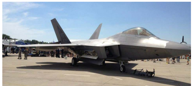
The old and the new. Latest generation F-22 fighter.