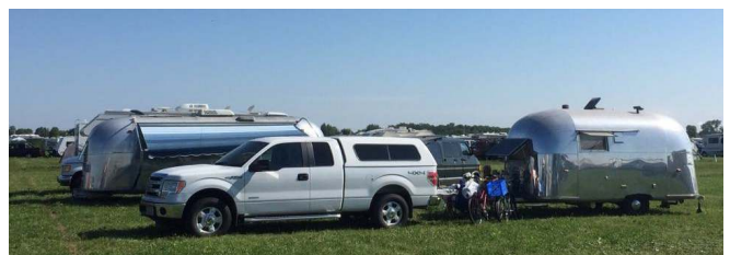
Airstreams way out in left field.