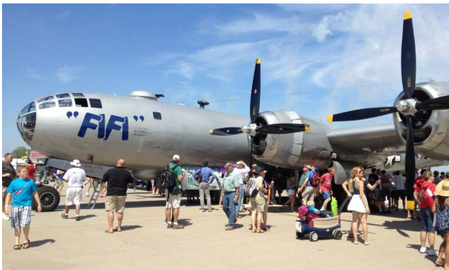
One of two B-29 bombers still flying.

We finished the day at the north end of the airfield among the Warbirds.