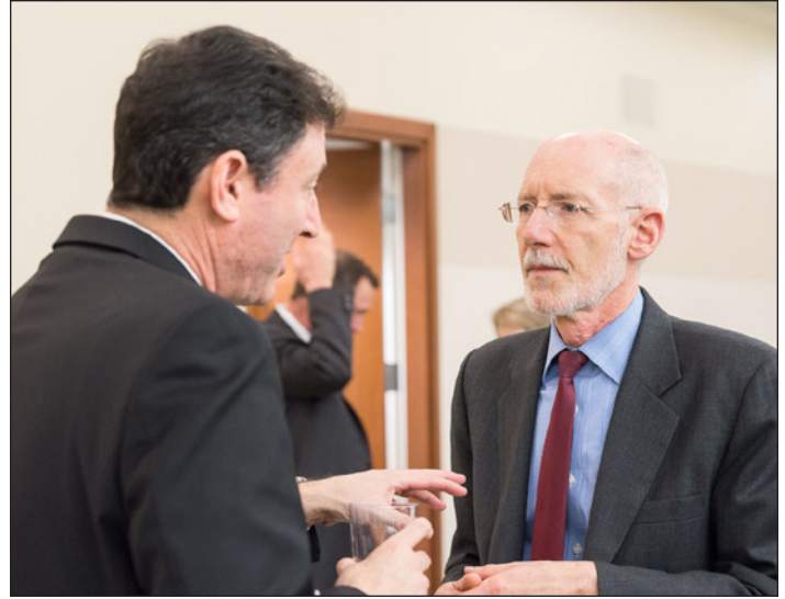
International Telecommunications Committee Reception