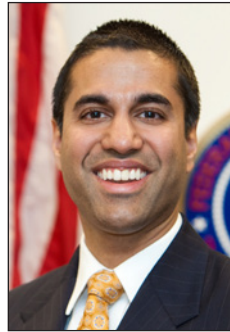
Commissioner Ajit Pai

The FCBA will be holding a luncheon on Thursday, February 21, 2013 featuring FCC Commissioner Ajit Pai. The luncheon will be held at the Mayflower Hotel, 1127 Connecticut Avenue, NW. Registration will begin at 11:30 a.m. and the luncheon will begin at Noon. Please note that tables of 10 are available, although you cannot register online for this option; you must download the form and fax or email it in with attendee names.