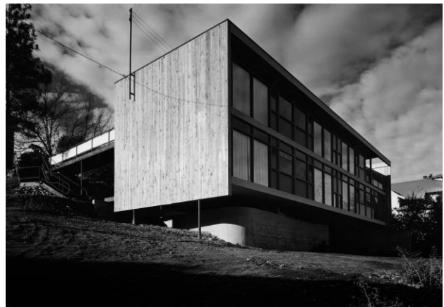
Photograph by Dearborn Masser. Year approximate.