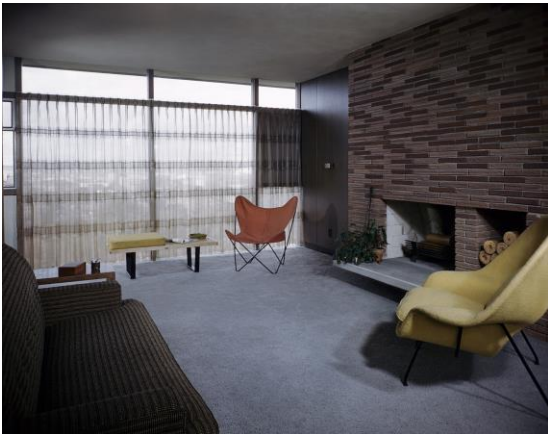
Year approximate. Interior 1950