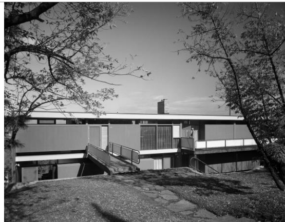
Year approximate.