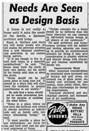
September 3, 1958, Spokane Daily Chronicle