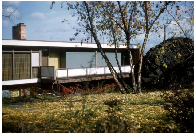
Year approximate. South facade 1960