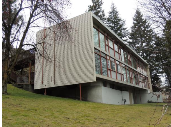
Northeast corner 2015