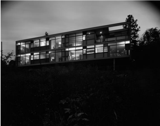
Year approximate. North facade 1950