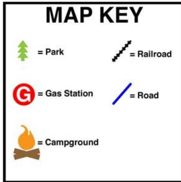
Example of a map key (legion and symbols)