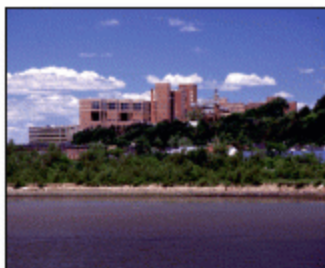
Division of Pulmonary & Critical Care Medicine

Charles A. Dana Health Education Center Maine Medical Center, Portland, Maine